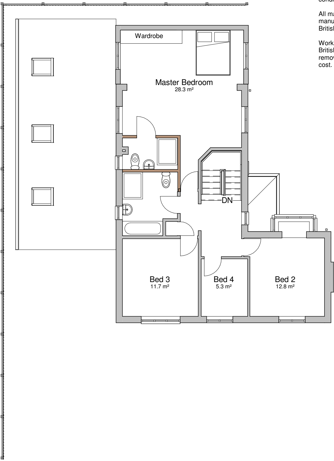
Proposed First Floor 1 : 100