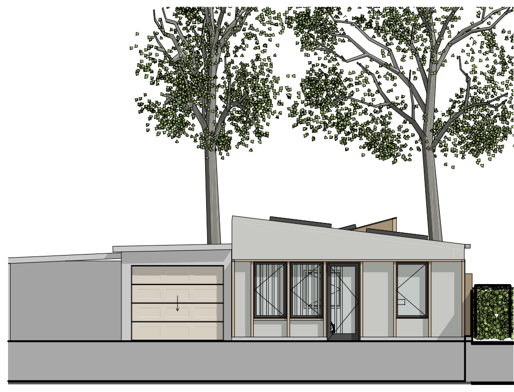
E - 01. SCALE 1/100