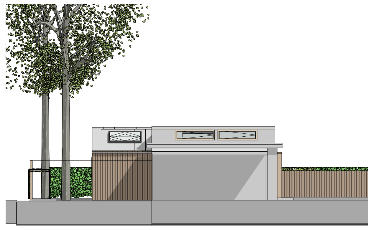
E - 02. SCALE 1/100