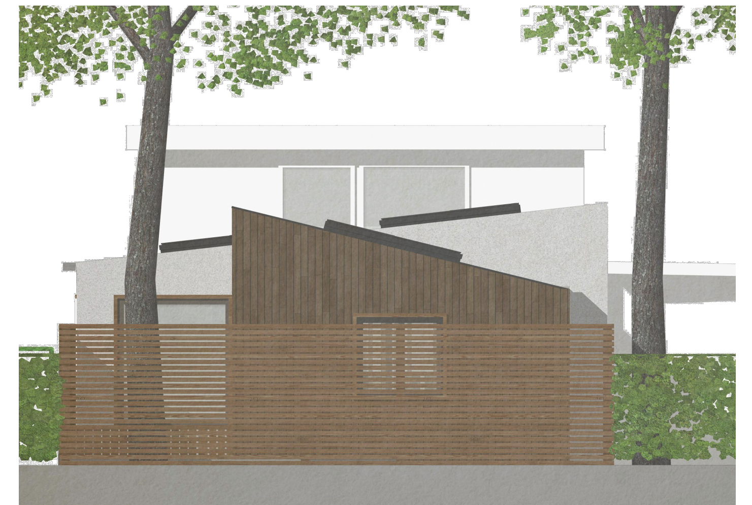
ELEVATION VISUALISATION. (not to scale)