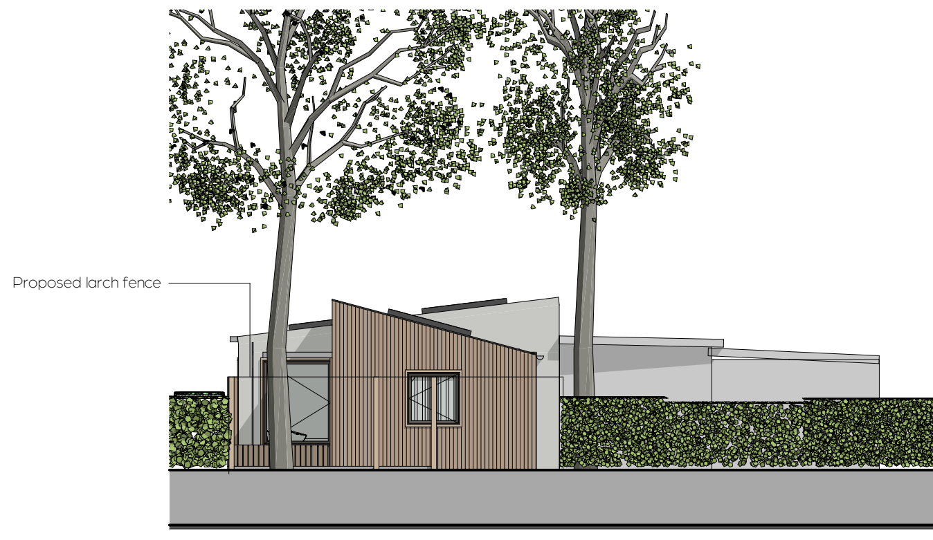
E - 03. SCALE 1/100