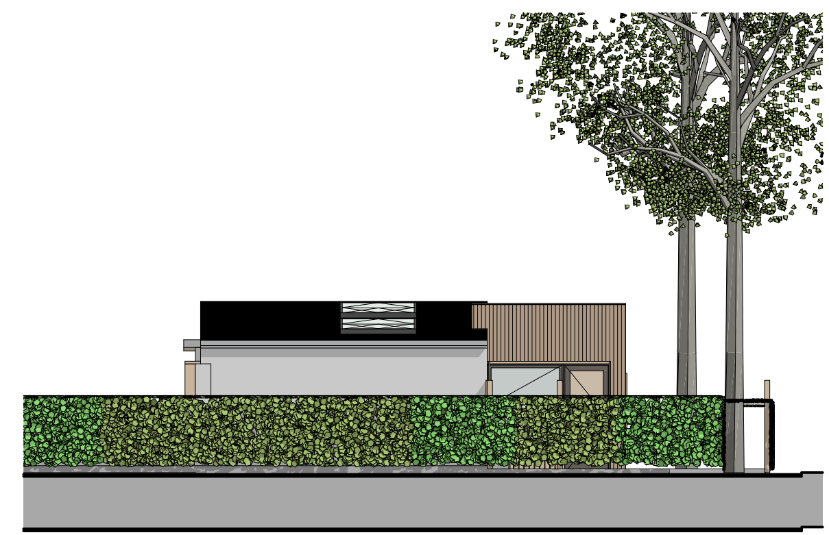
E - 04. SCALE 1/100