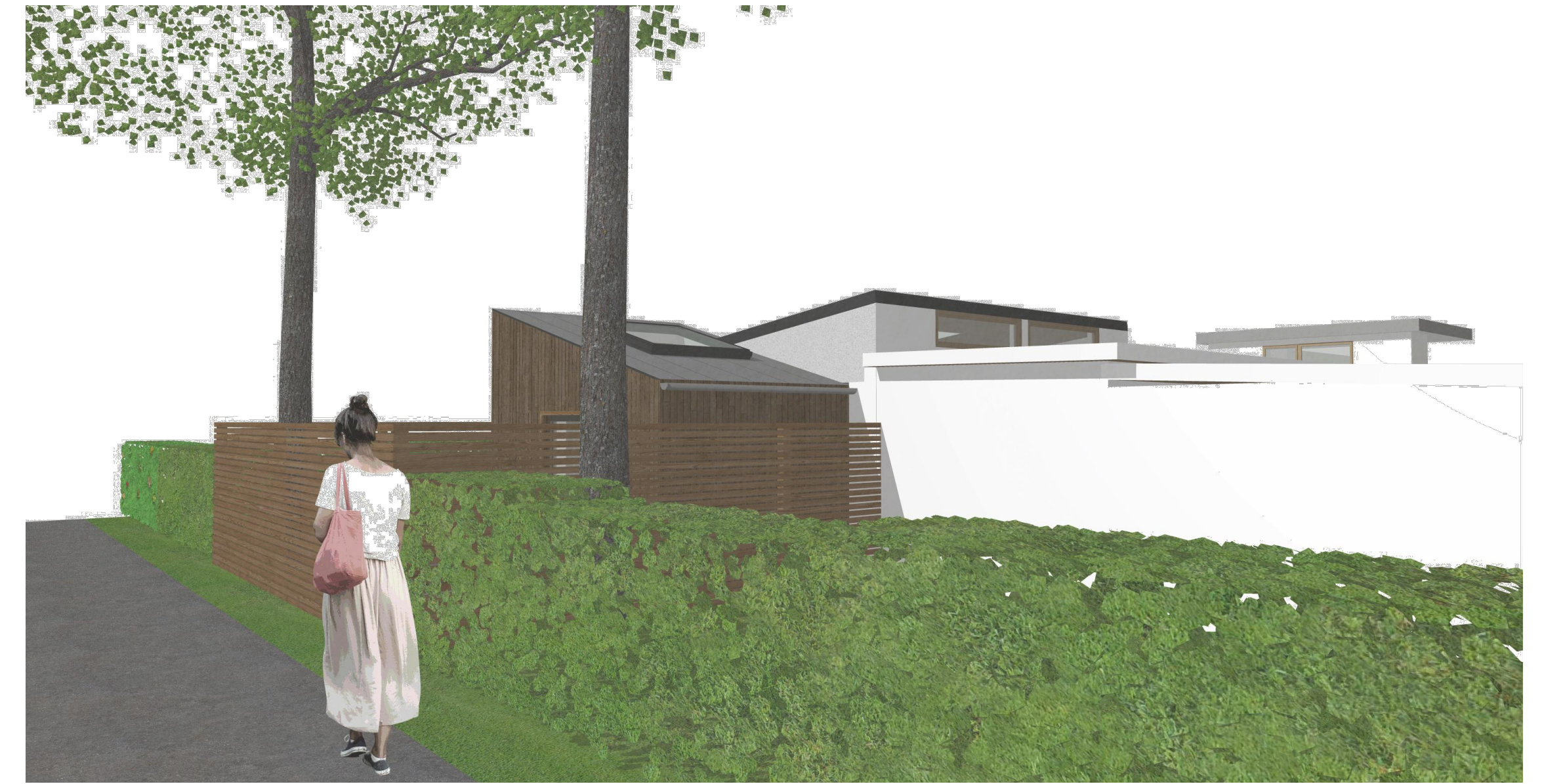
PERSPECTIVE VIEW FACING EXTENSION FROM THE ROAD. (not to scale)