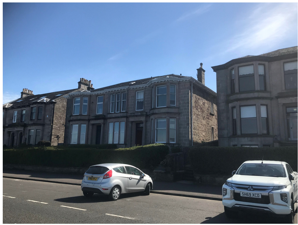
Oblique View of Front and Side from Esplanade