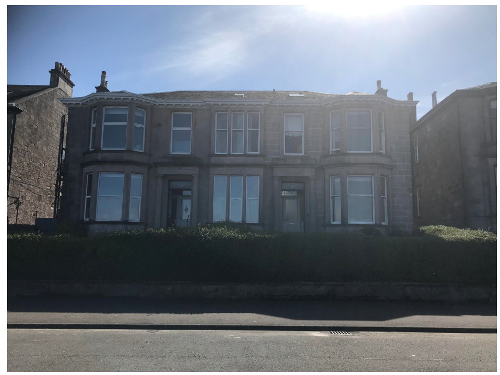
View of Frontage of whole block (No.51 is to the right)