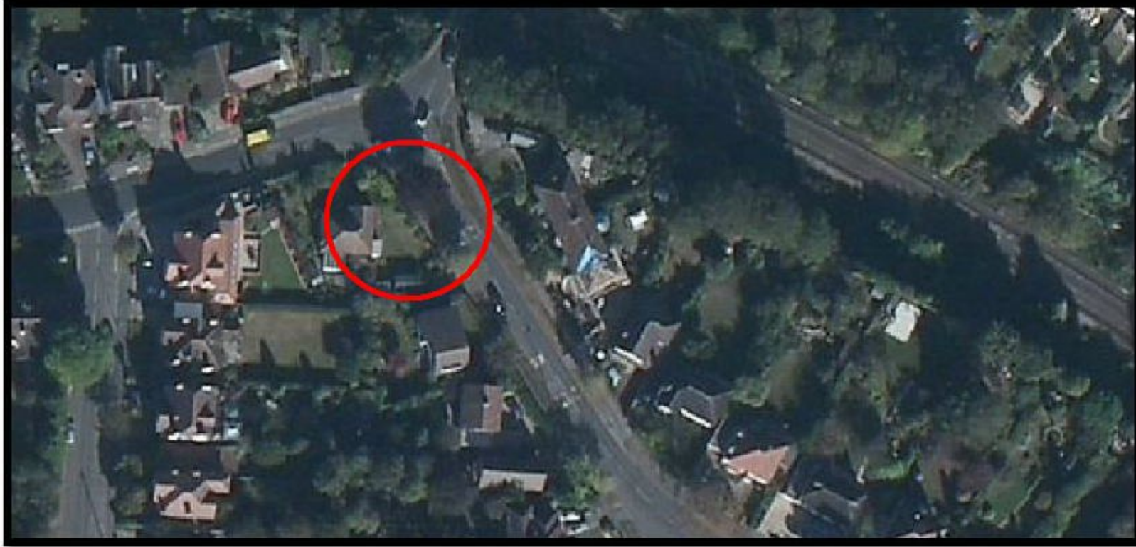
Figure 2: Aerial Image of Site

It is proposed to demolish the existing dwelling and replace with a new single occupancy dwelling with associated parking.