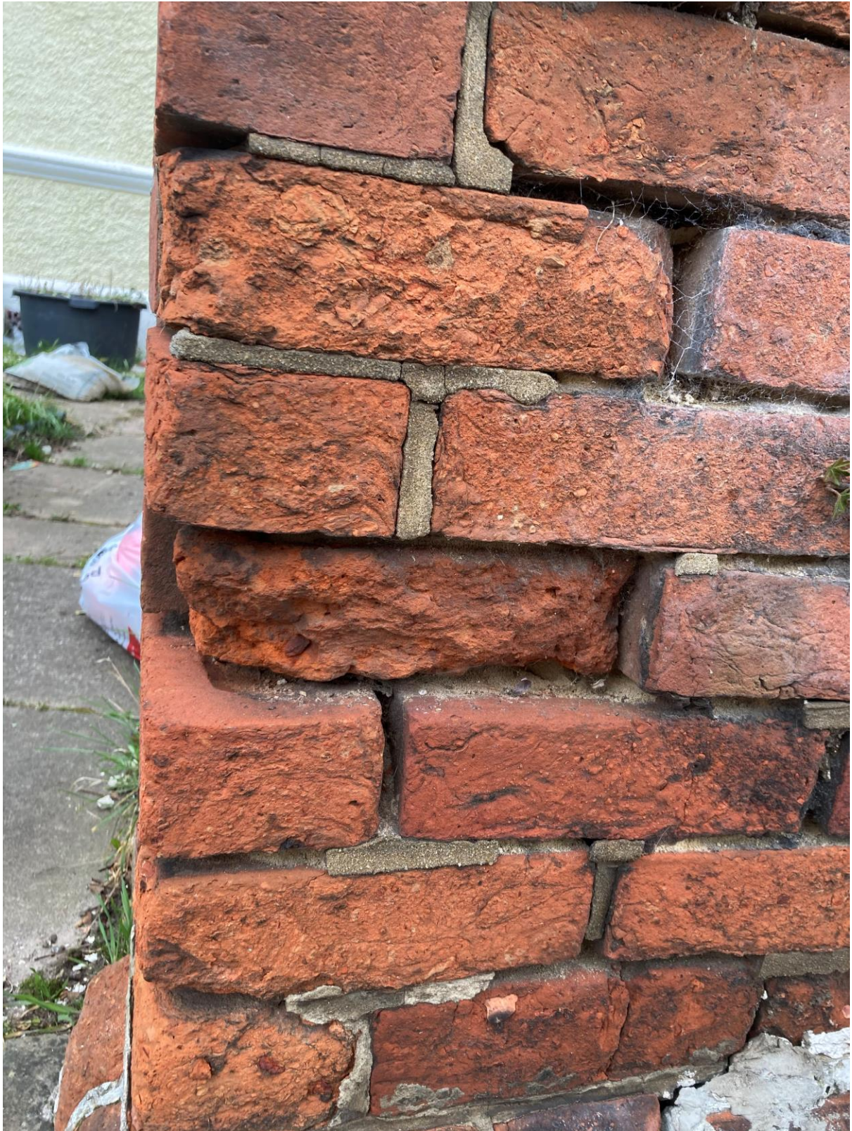
The last part of our proposal is to reattach gates onto front driveway pillars. There clearly used to be gates on these at some point in time as shown in photo.