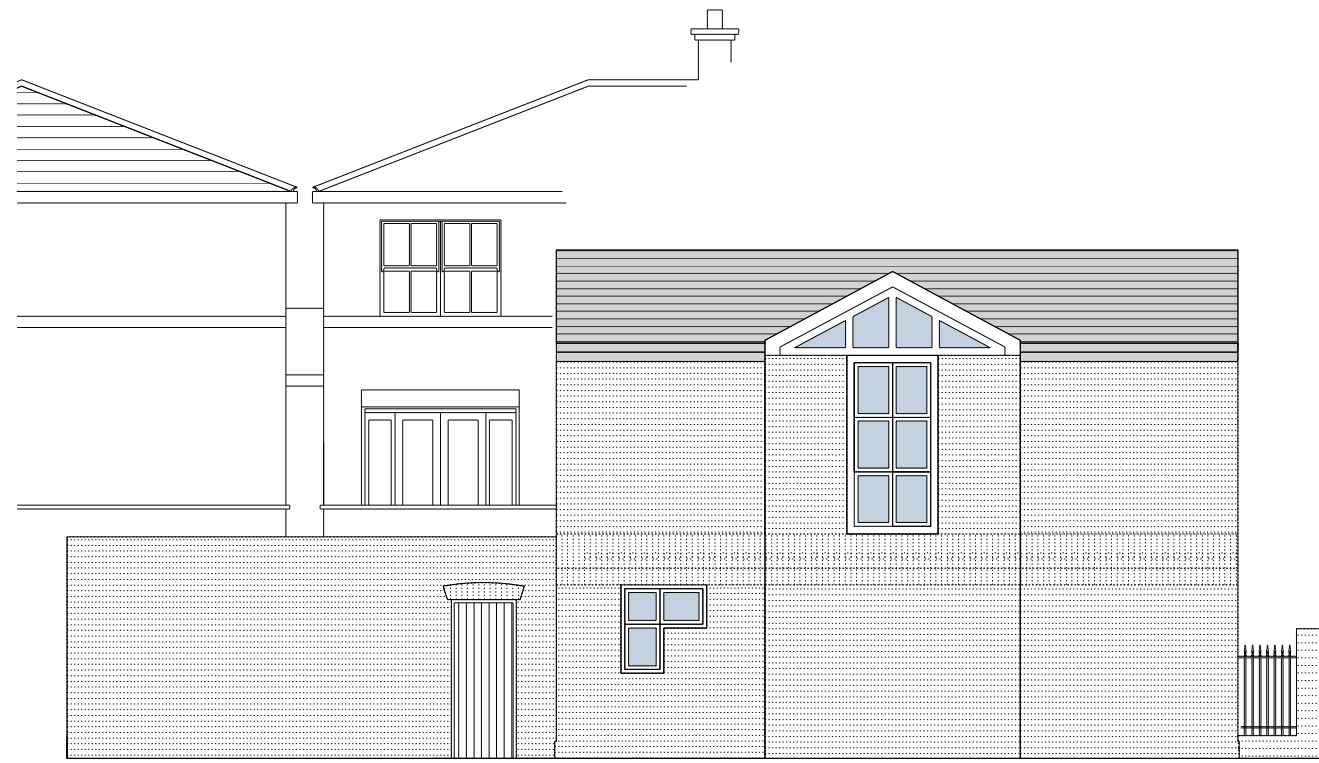
PROPOSED SOUTH ELEVATION (STREET)