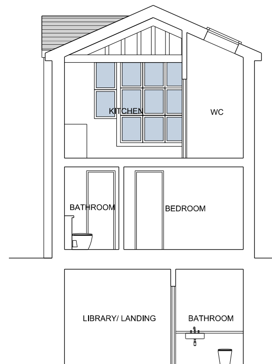
PROPOSED SECTION B-B