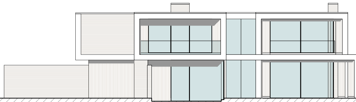
0m 5m NORTH WEST ELEVATION