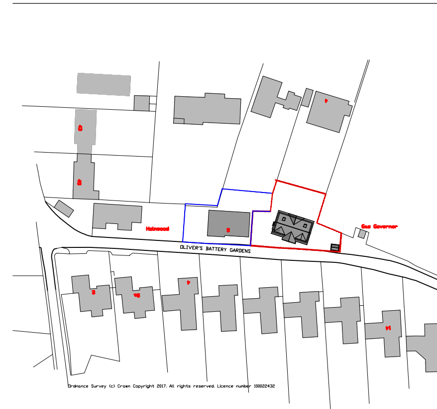
Approved Location Plan 1:1250