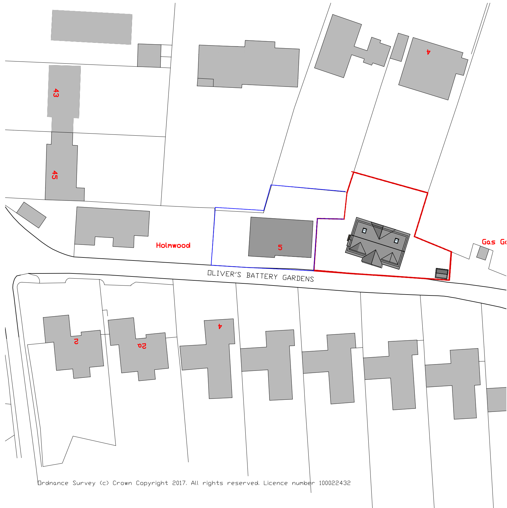
Approved Site plan 1:500

This drawing is copyright and is not to be reproduced. The contractor will be held responsible for the accuracy of works involving the setting out and checking of all dimensions on the drawing and on site. Dimensions must not be scaled from this drawing.