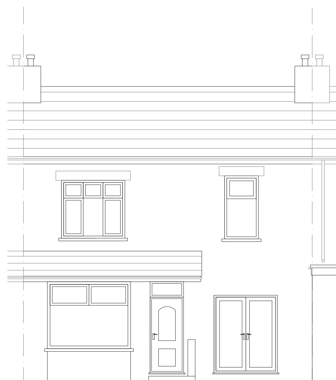
Rear Elevation – Existing Scale 1:100 @ A3