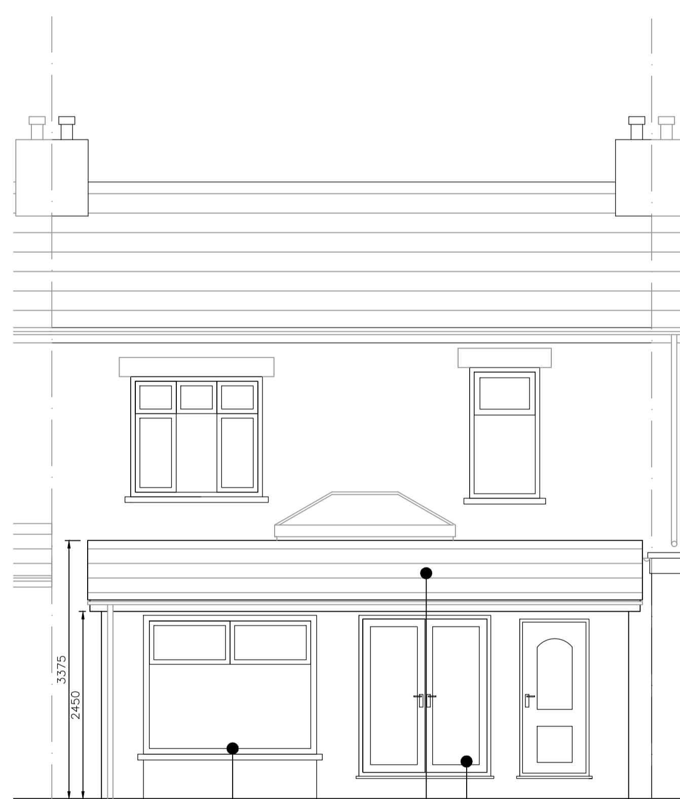
Rear Elevation – Proposed Scale 1:100 @ A3