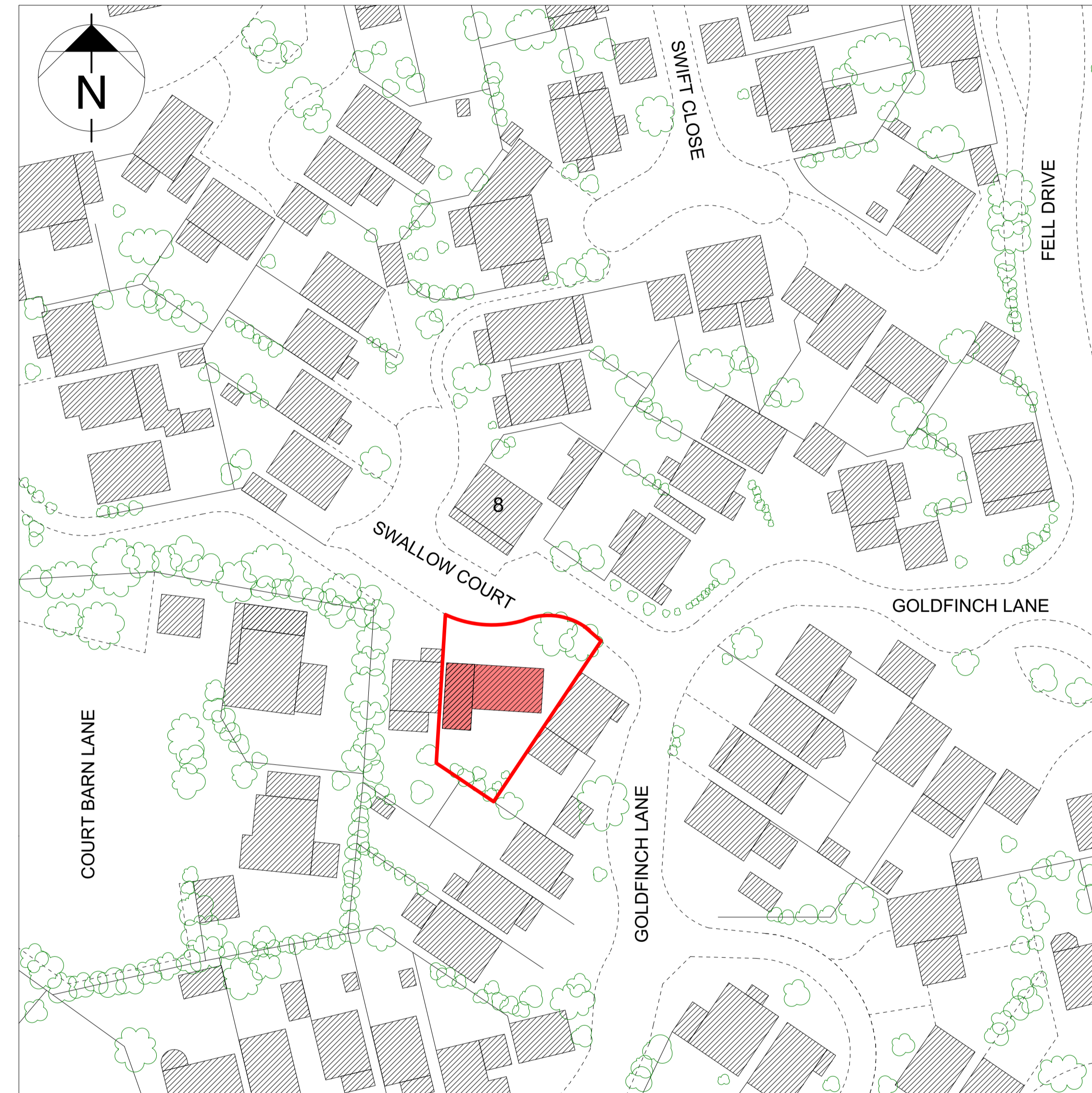
BLOCK PLAN - SCALE 1:500

0 10 50 100mm DIMENSION AT ORIGINAL SHEET SIZE Contractors must check all dimensions on site. Only figured dimensions are to be worked from. Discrepancies must be reported to the Architect before proceeding. © This drawing is Copyright CONTRACTORS, SUB-CONTRACTORS AND MANUFACTURERS TO ENSURE THAT ALL MATERIALS AND COMPONENTS ARE SUITABLE FOR THEIR INTENDED PURPOSE AND LOCATION. DESIGNED, MANUFACTURED AND INSTALLED IN ACCORDANCE WITH ALL RELEVANT CURRENT BRITISH STANDARDS, CODES OF PRACTICE, AND MANUFACTURER'S SPECIFICATIONS. WHERE AN ITEM IS COVERED BY DRAWINGS TO DIFFERENT SCALES THE LARGER SCALE DRAWING IS TO BE WORKED TO. DO NOT SCALE DRAWING. FIGURED DIMENSION ONLY TO BE WORKED TO. ALL DETAILS SUBJECT TO BUILDING CONTROL INSPECTORS' AGREEMENT