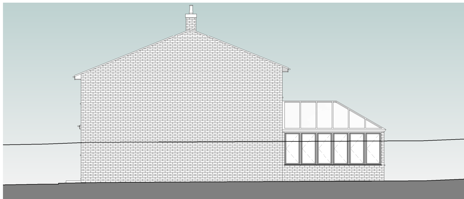
E3 Existing RHS 1 : 100