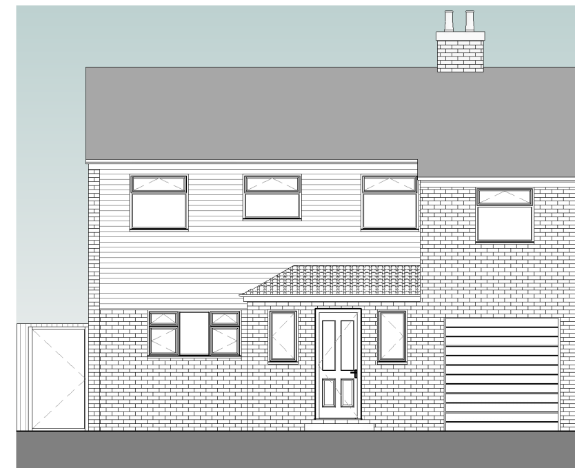
E2 Existing Front 1 : 100