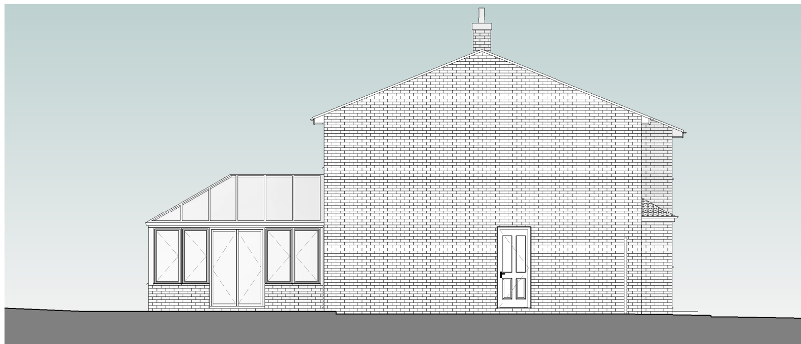
E1 Existing LHS 1 : 100