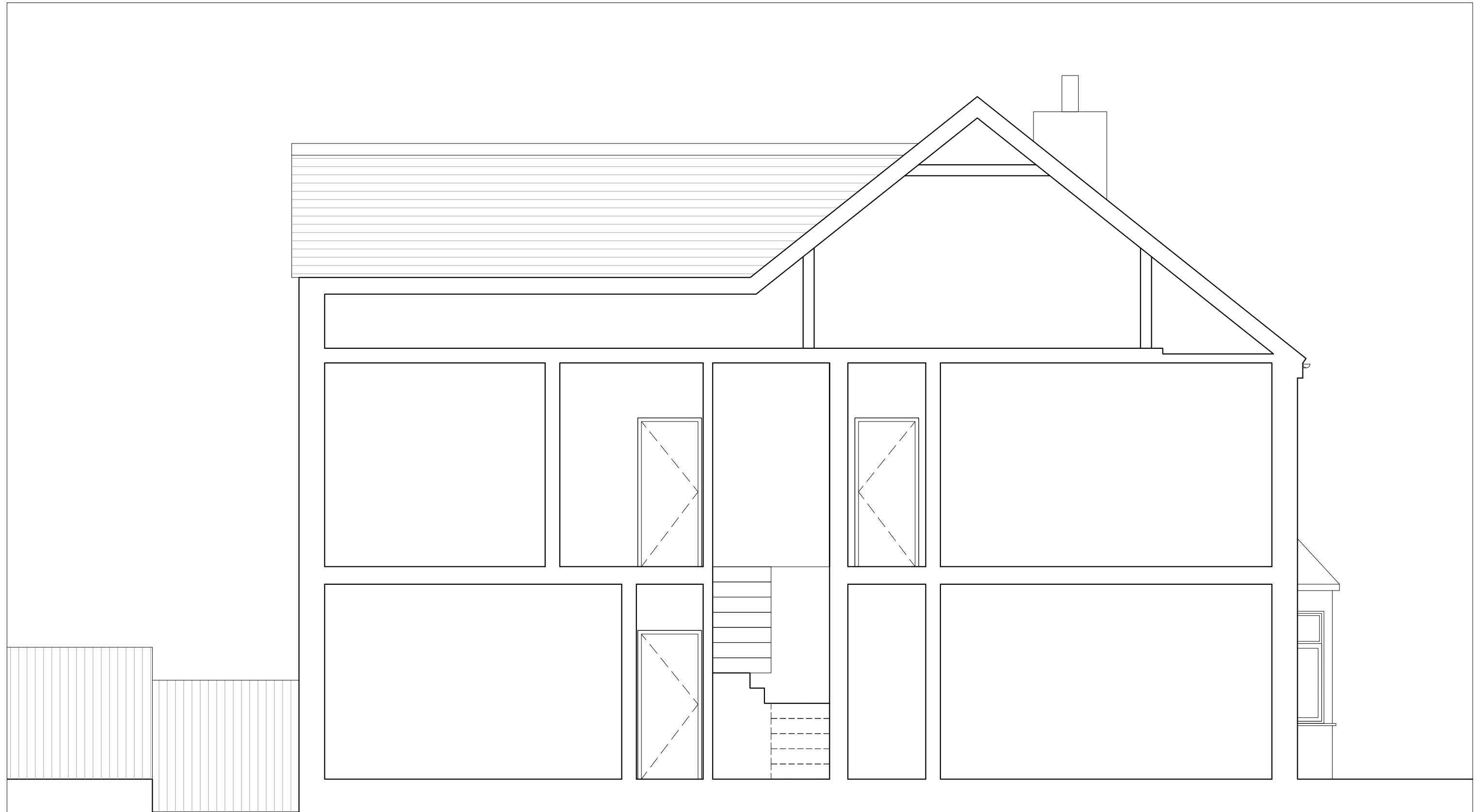
EXISTING LONG SECTION

Note to the builder: This drawing is to be read in conjunction with all related drawings. All dimensions must be checked and verified on site before commencing any work. The originator should be notified immediately of any discrepancy.