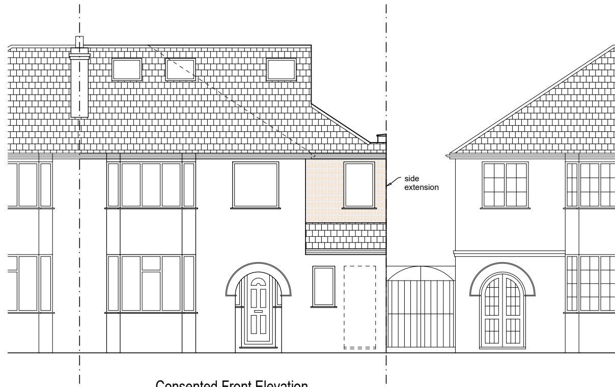
Consented Front Elevation