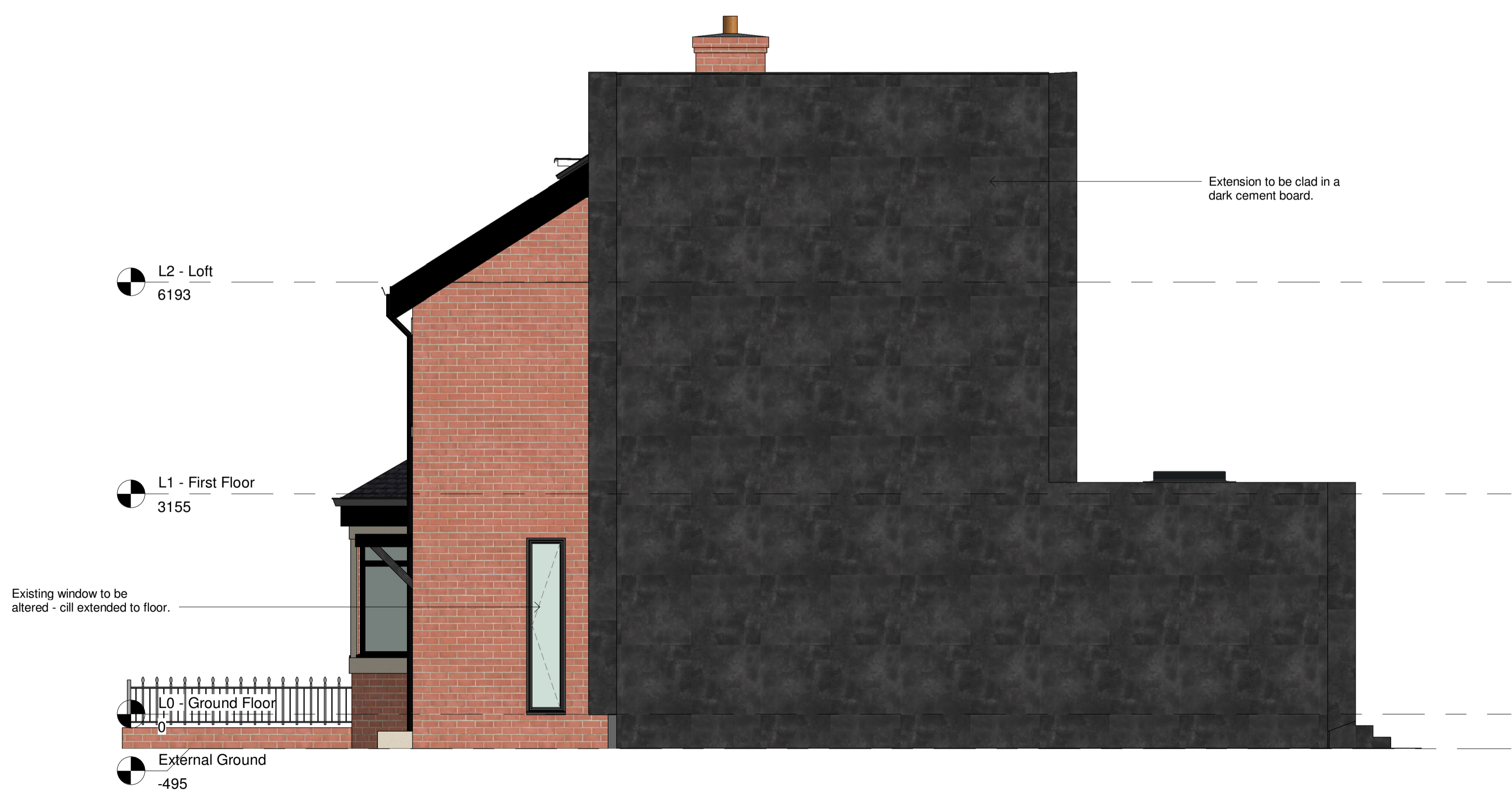
East Elevation - Proposed 1 1:50