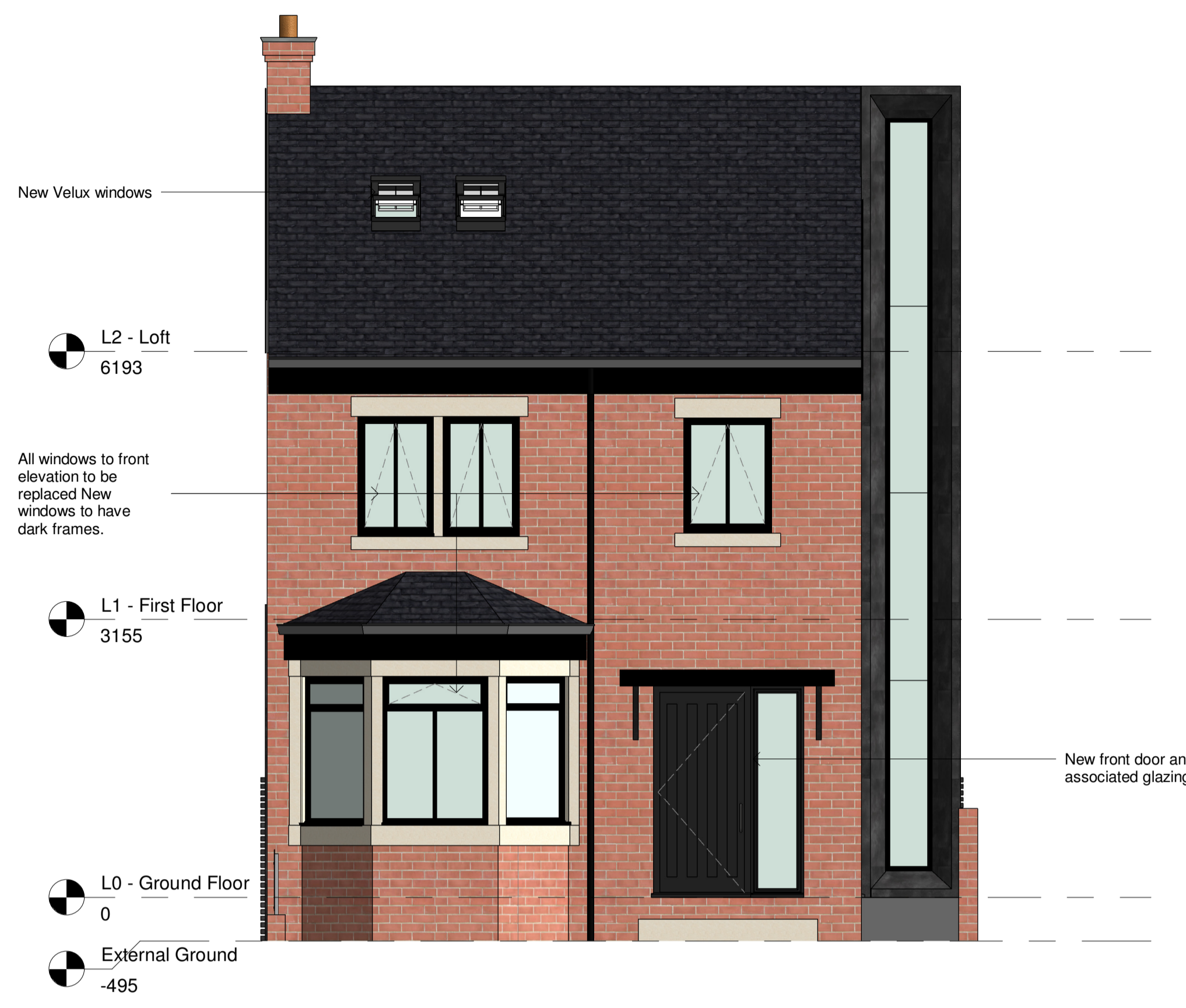
South Elevation - Proposed 3 1:50