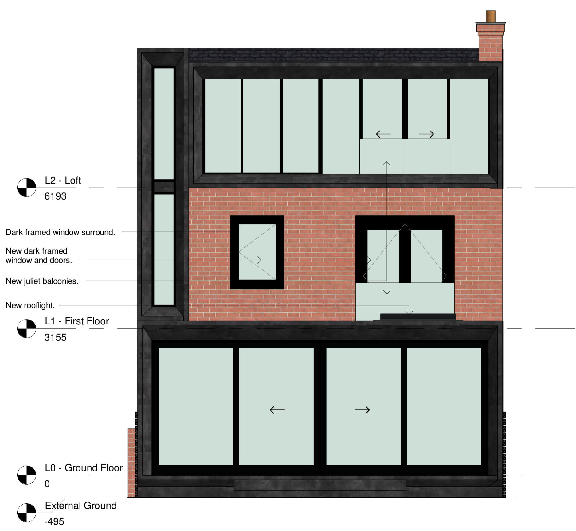
North Elevation - Proposed 2 1:50