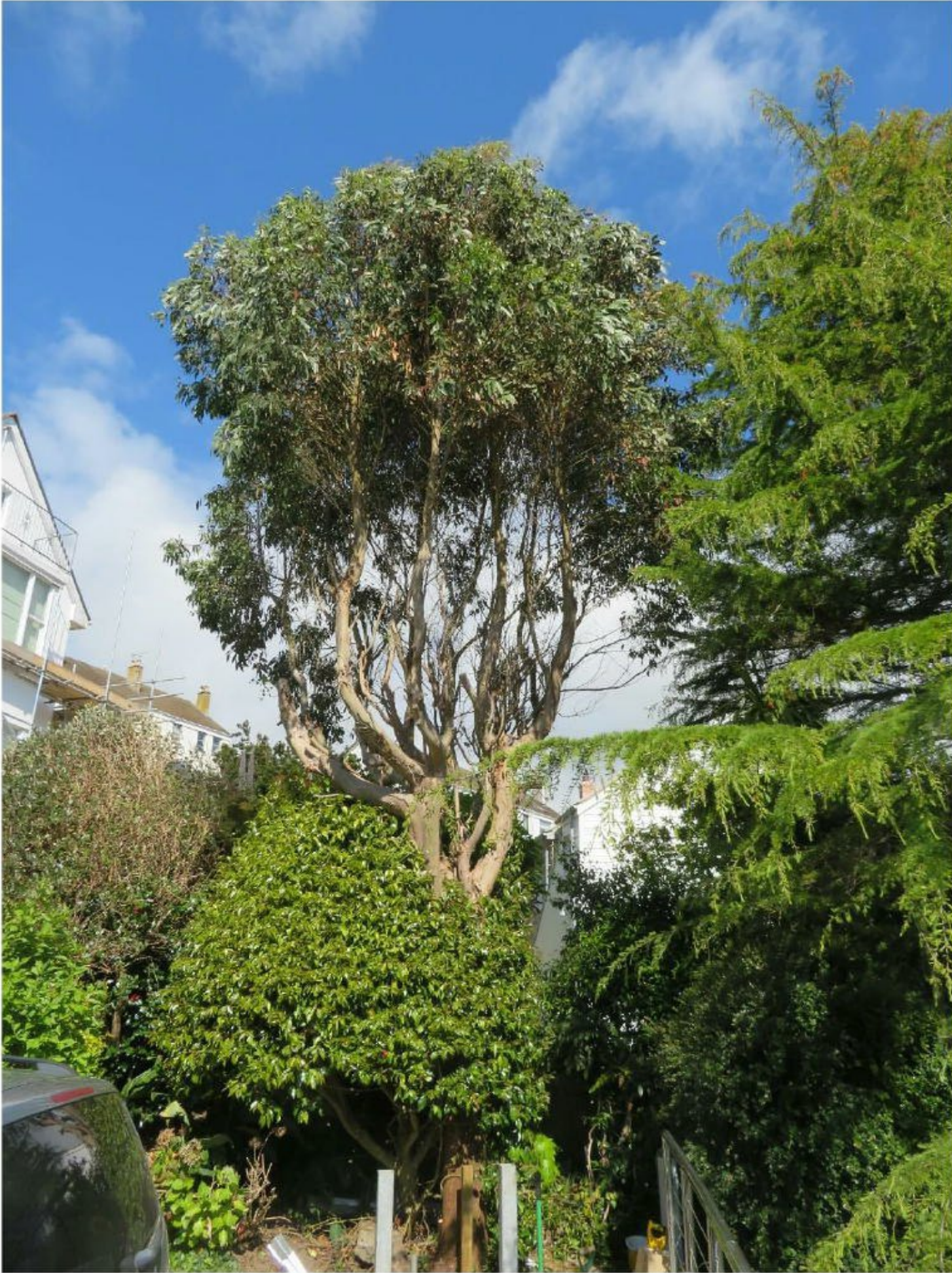
T1 from south.