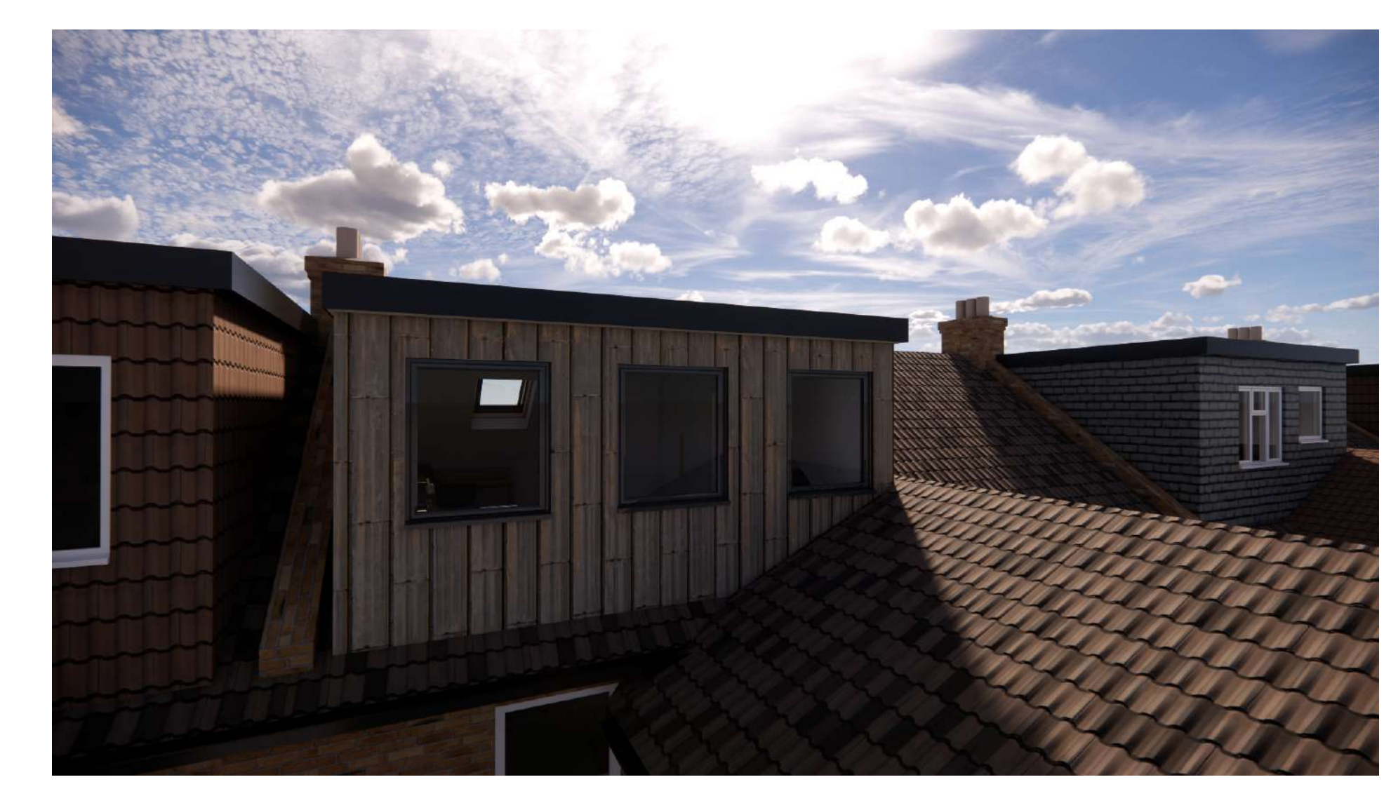
External visual of proposed dormer