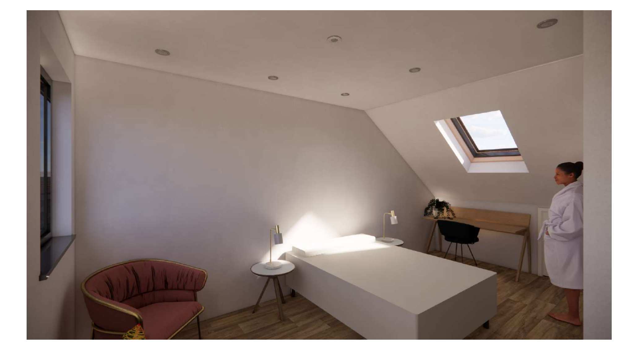
Internal visual of proposed master bedroom 01