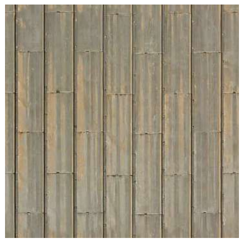
Proposed standing seam zinc cladding