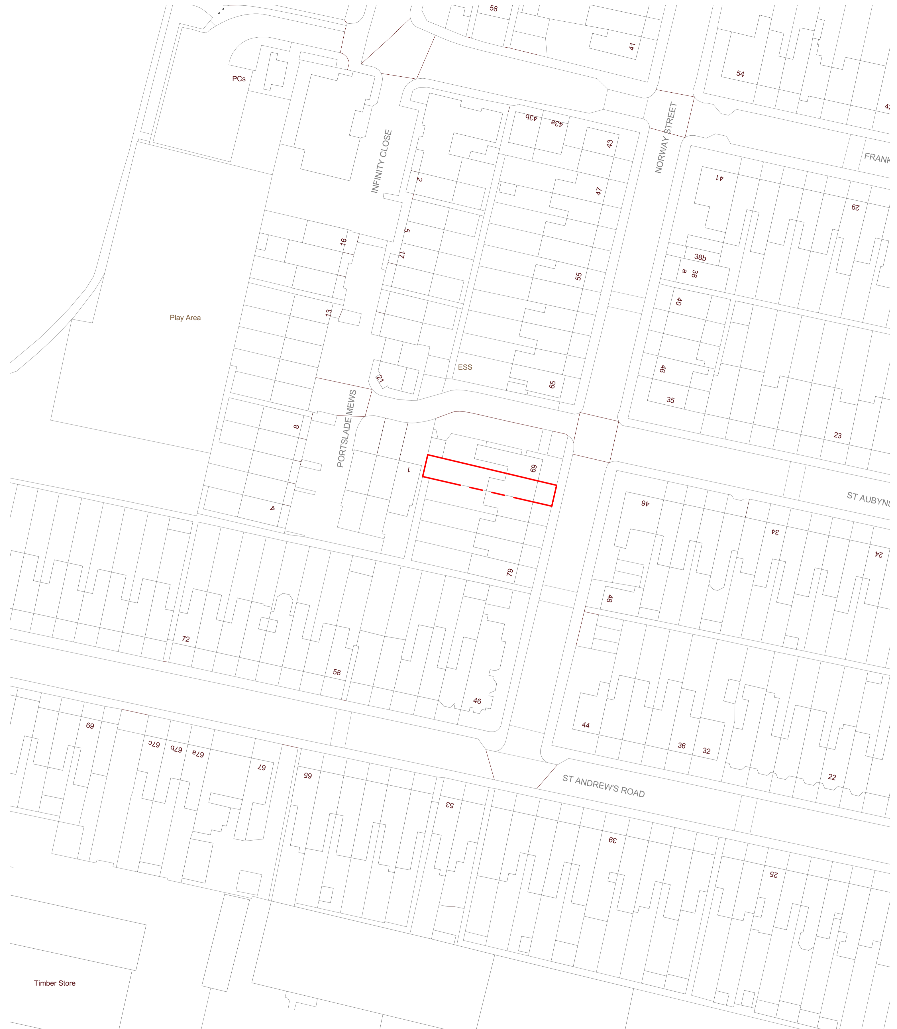
+ 00 - Block Plan 1 : 500

CDM 2015 Health & Safety Information This information relates only to 'Significant Hazards' identified on this drawing and is to be read in conjunction with the Designer's Risk Assessment Register. © ZEDesigns - No dimensions to be scaled from drawing except for the purposes of Planning Applications. The contractor should check all dimensions on site. It is the contractors responsibility to ensure compliance with Building Regulations.