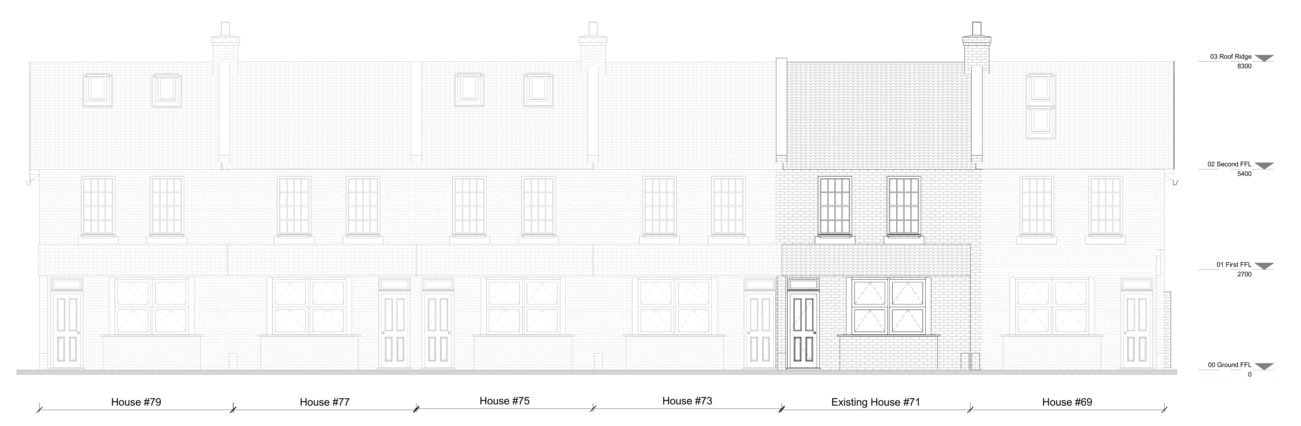
EL - Existing Street Elevation - East Elevation 1:50