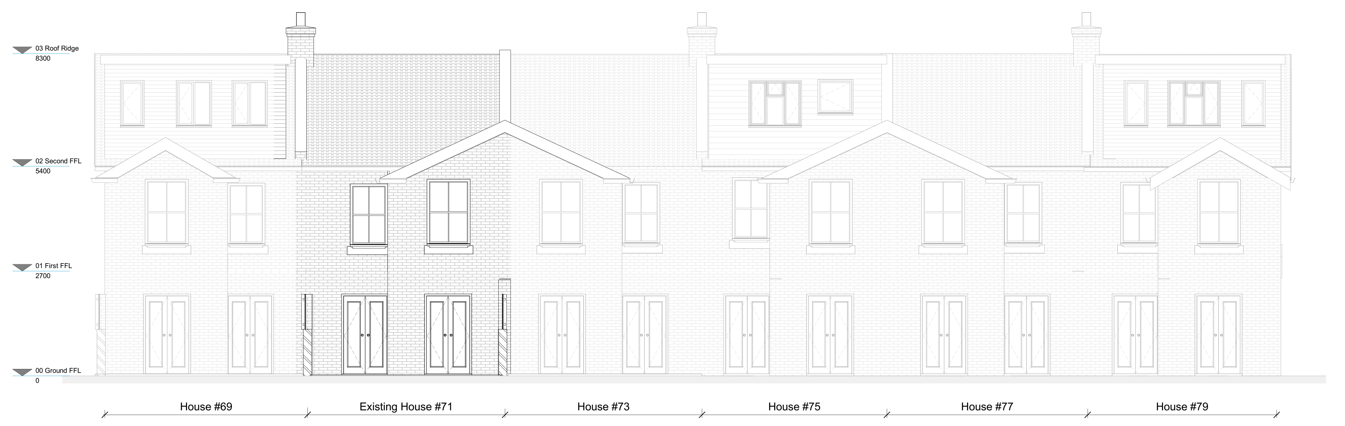
EL - Existing Street Elevation - West Elevation 1:50

© ZEDesigns - No dimensions to be scaled from drawing except for the puposes of Planning Applications. The contractor should check all dimensions on site. It is the contractors responsibility to ensure compliance with Building Regulations.