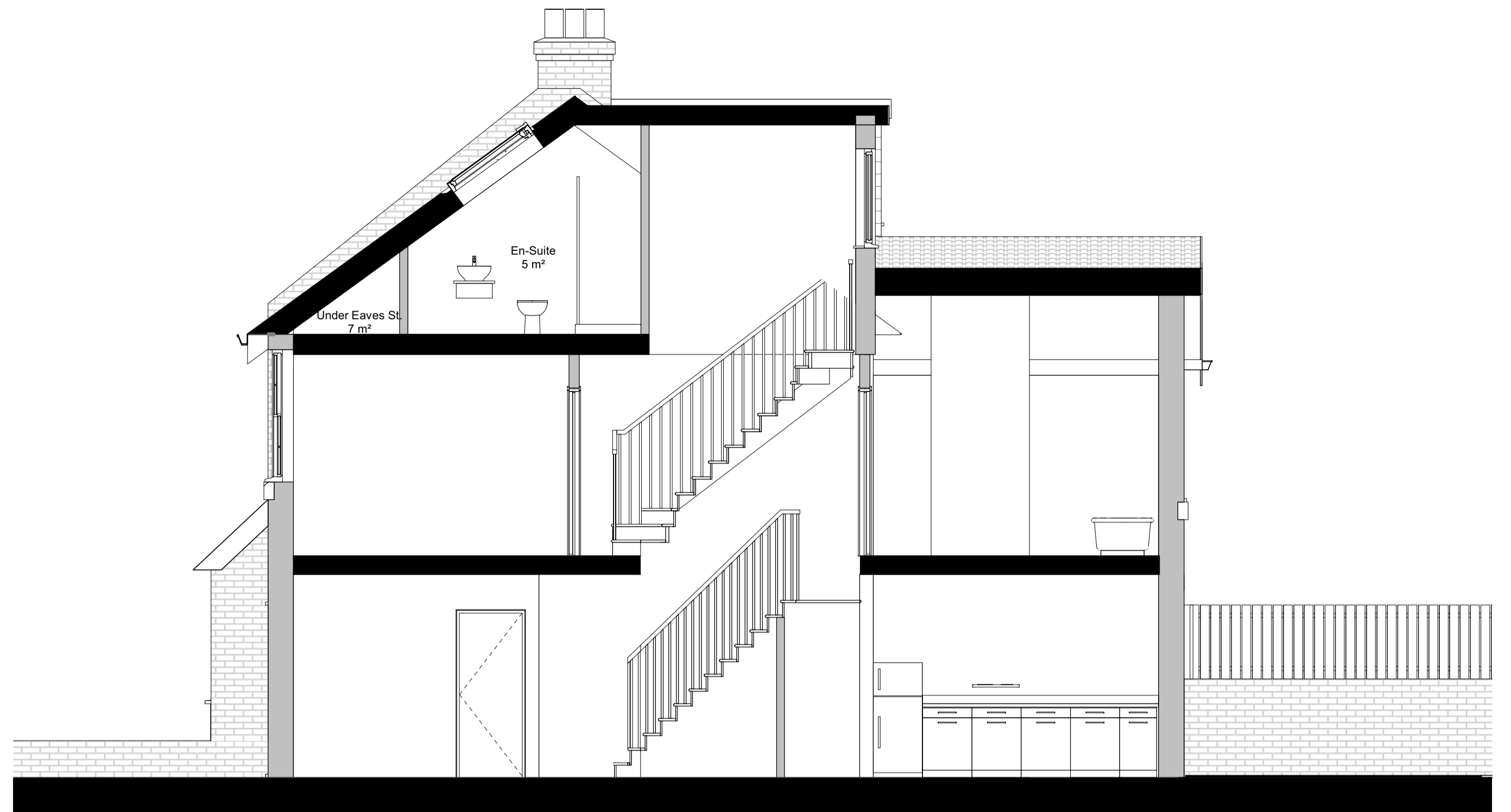
SC - Proposed Section CC 1 : 50