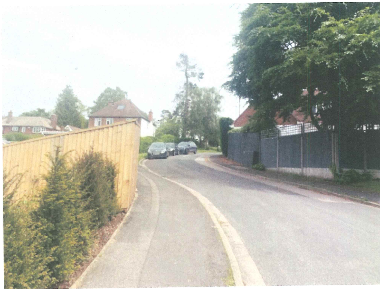
VIEW UP SHOWING 8' (2.4m) FENCE OPPOSITE TO ENCLOSE GARDEN.