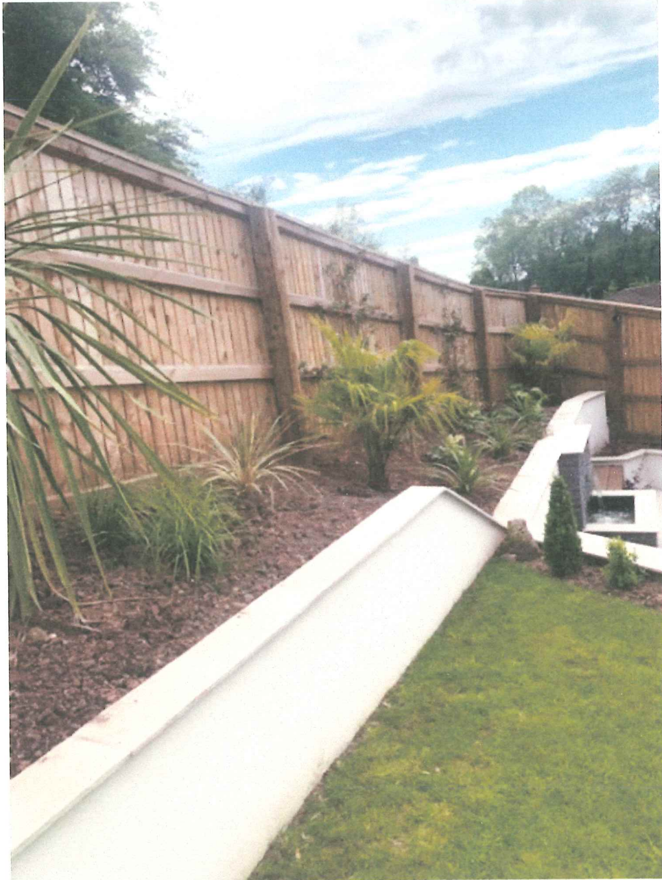
INSIDE VIEW SHOWING ENCLOSED GARDEN.