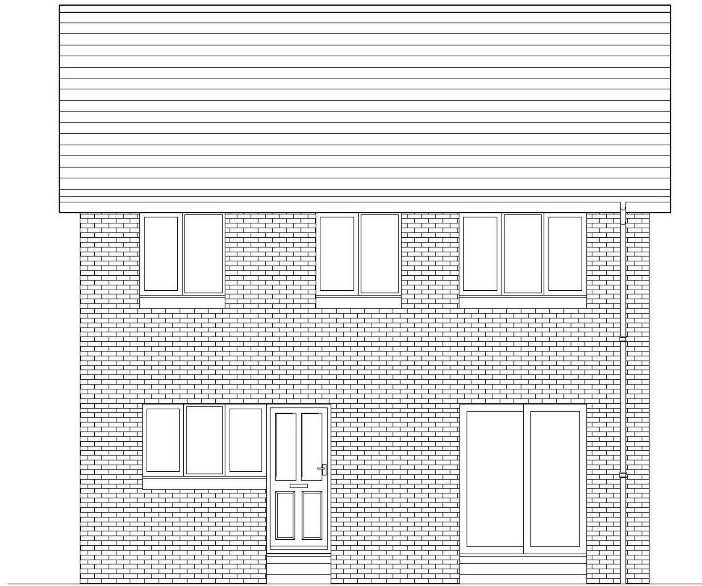
REAR ELEVATION AS EXISTING 1:50

The purpose of these drawings are solely for the purposes of obtaining planning approval. The drawing may be suitable for construction purposes but it may be necessary to augment/and or amend this information for this purpose. No liability will be accepted for any omission on this drawing should the drawing be used for construction purposes.