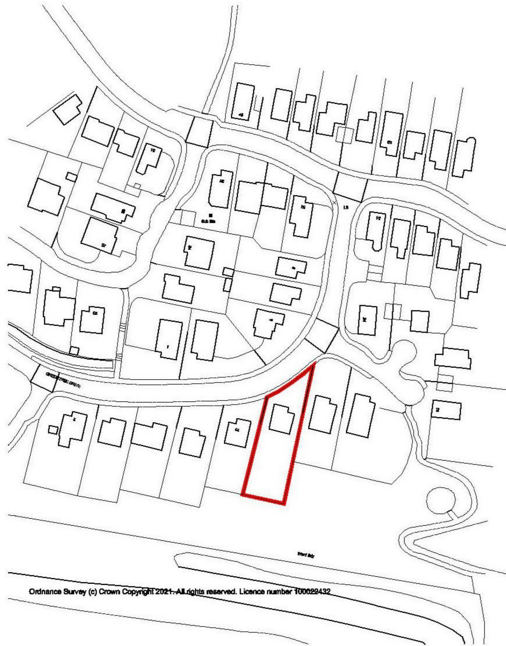
1:1250 Location Plan