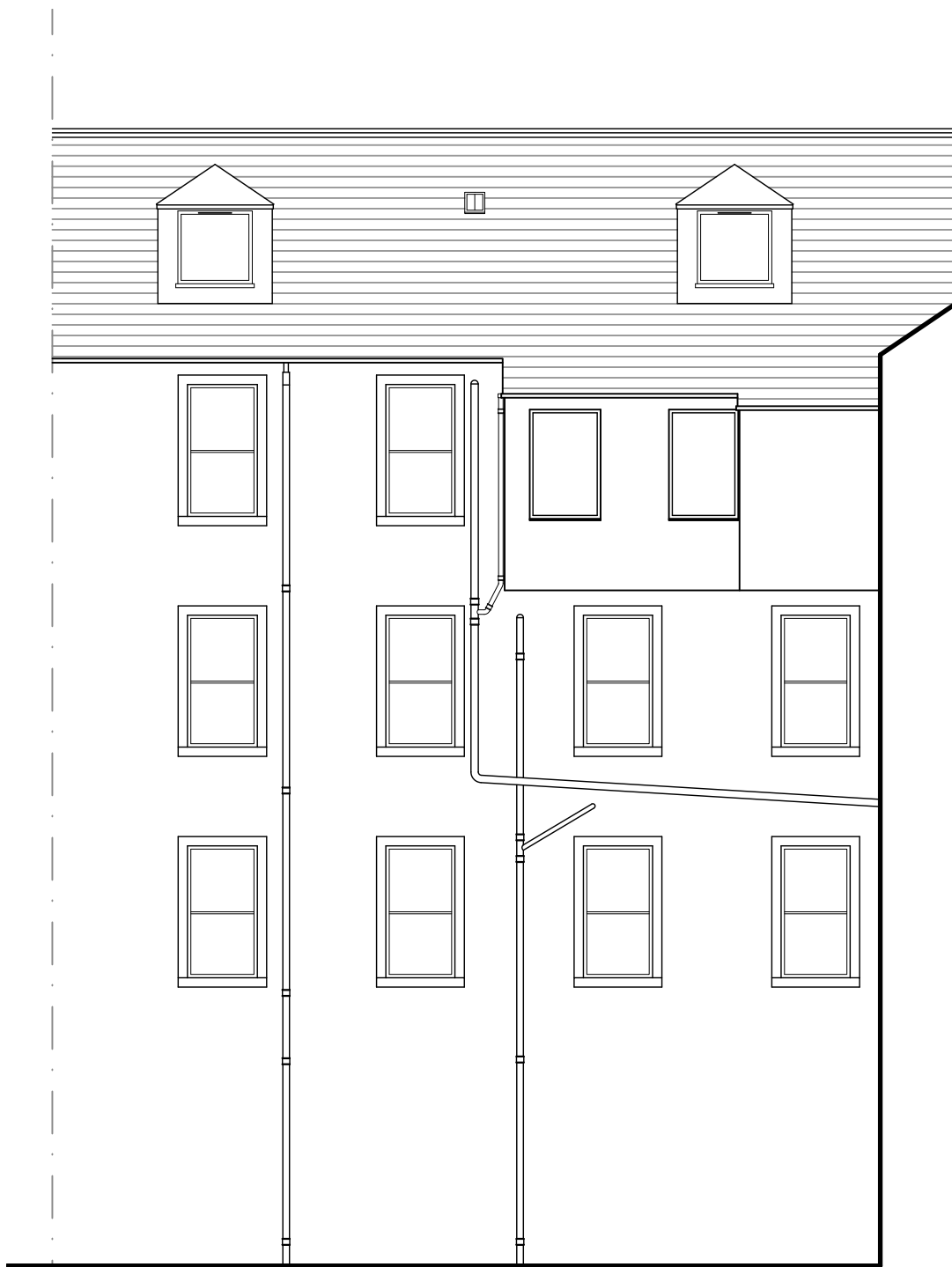
Existing Rear (WEST) Extension 1/100 @ A3