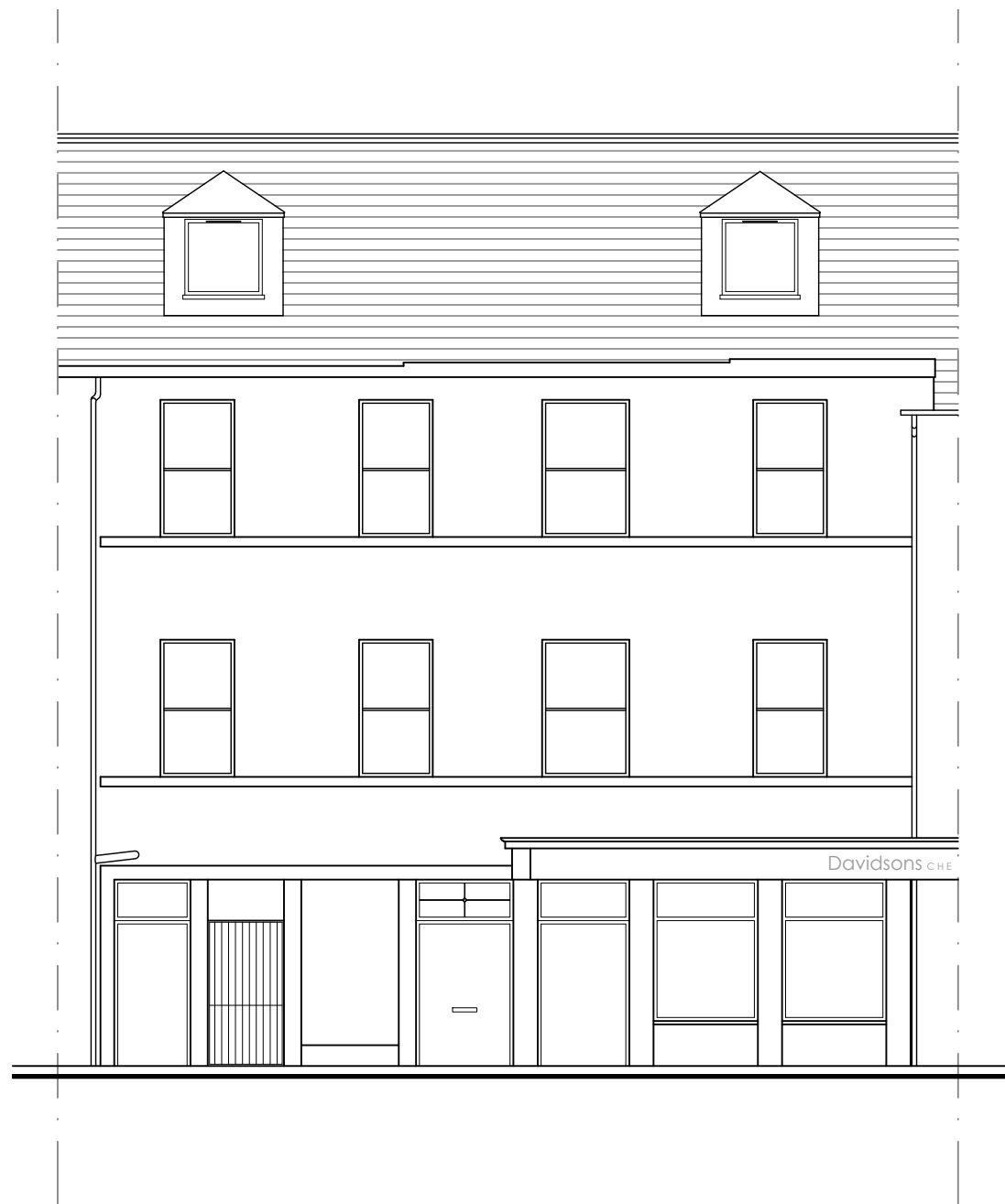
Existing Front (EAST) Elevation 1/100 @ A3