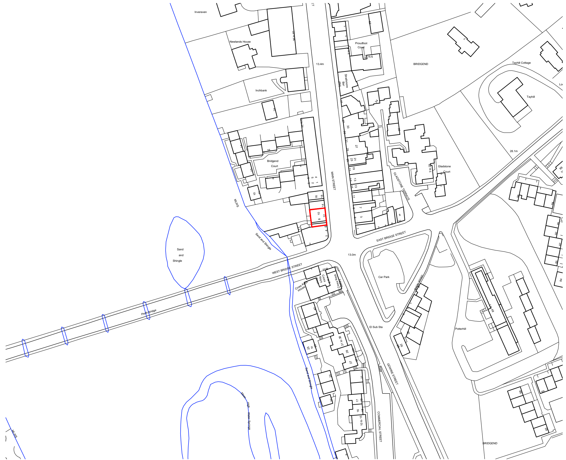
Location Plan 1/1250 @ A3