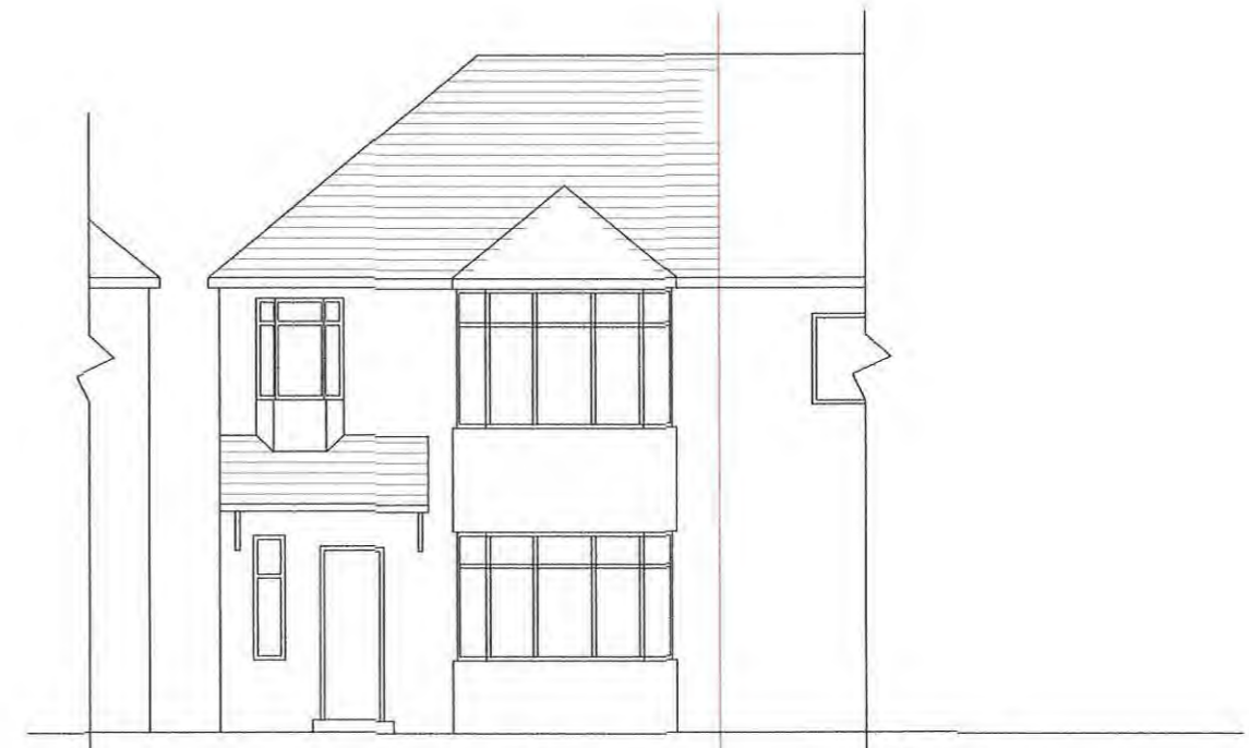
No. 77 No. 75 EXISTING FRONT ELEVATION (NO CHANGE)