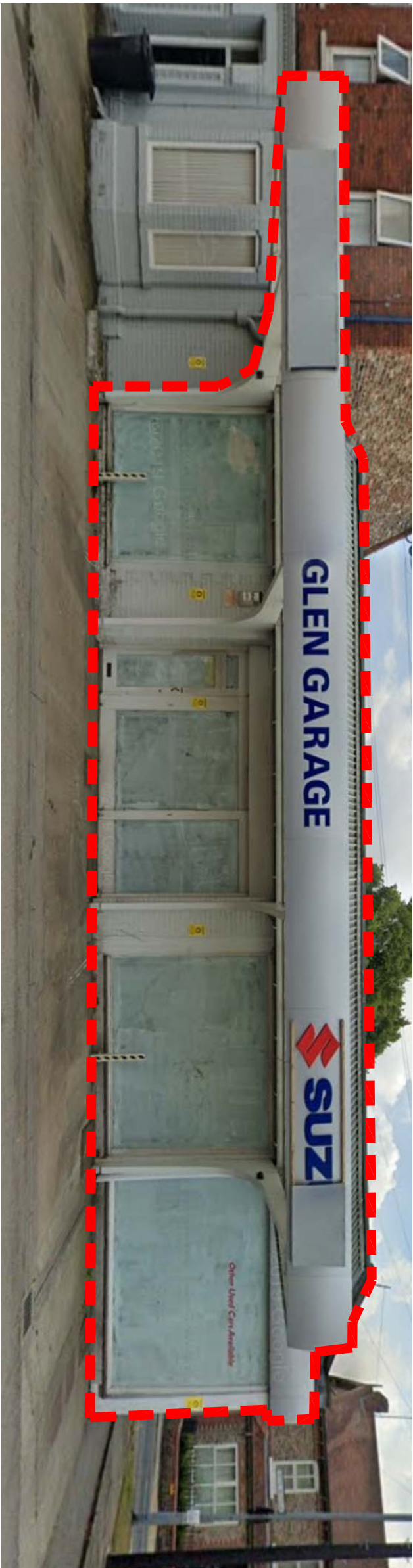
Existing Glen Garage to be demolished elevation, Hawthorn Grove.