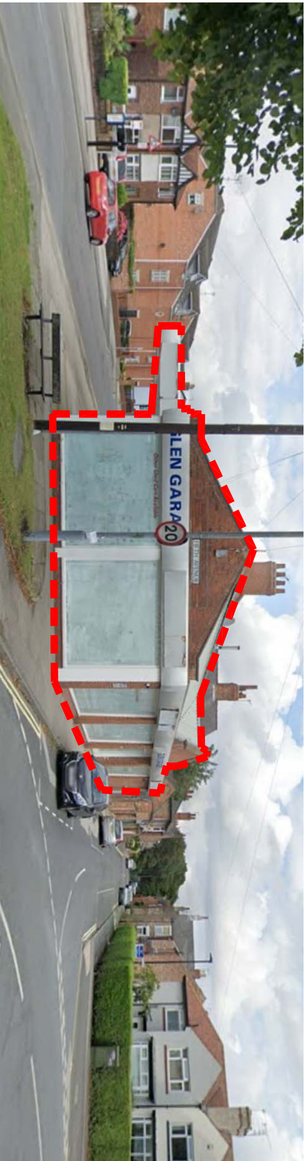
Existing Glen Garage to be demolished elevation, Hawthorn Grove / Glen Road junction.