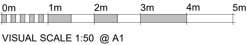
VISUAL SCALE 1:50 @ A1

A notification of a proposed larger Home Extension Under the conditions set by permitted development legislation, householders are able to build larger single-storey rear extensions in certain circumstances. Generally, single-storey rear extensions must not extend beyond the rear wall of the original house by more than 8 metres if a detached house; or more than 6 metres for any other house Before development commences, the relevant local planning authority must be notified of the proposed work so that they can determine if their prior approval is required for the extension, based on consultation with neighbouring properties. This is done by completing and submitting the 'Notification of a proposed larger Home' application form.