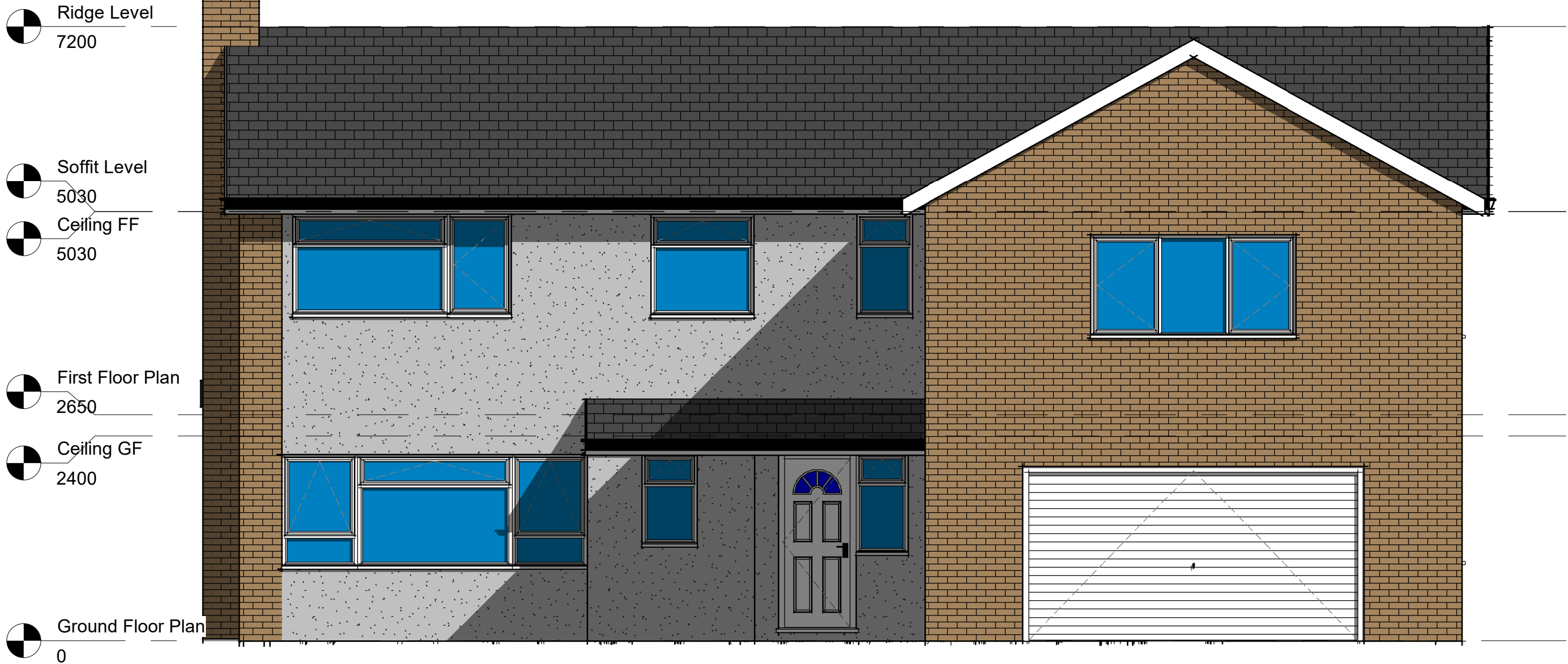
1 Front Elevation - Levels 1 : 50