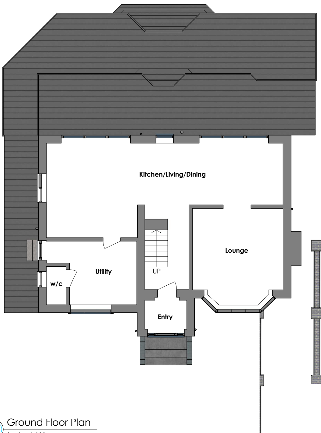
Ground Floor Plan Scale: 1:100