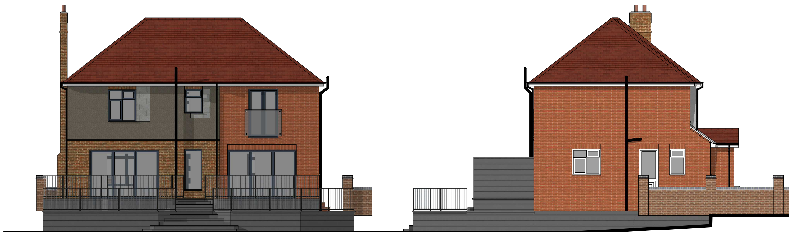
Rear Elevation Scale: 1:100