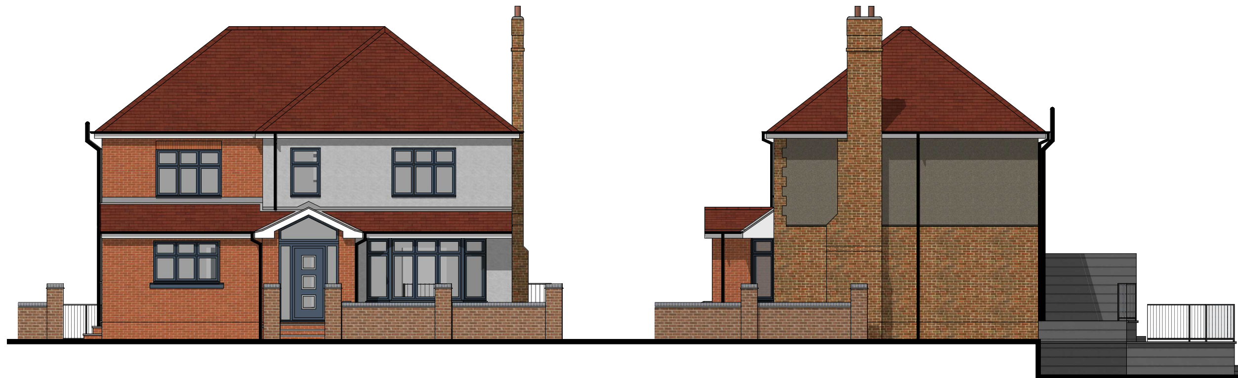
Front Elevation Scale: 1:100

All dimensions given are to assist in the pricing of works. It is the responsibility of the person carrying out the works to verify all dimensions on site prior to placing orders or carrying out works.