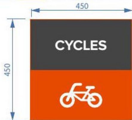
Sign: 010 - Scale 1:10 1-off Folded Panel Finished Orange c/w Vinyl Decoration Fitted to Cladding