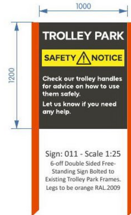
Sign: 011 - Scale 1:25 6-off Double Sided Free- Standing Sign Bolted to Existing Trolley Park Frames. Legs to be orange RAL.2009