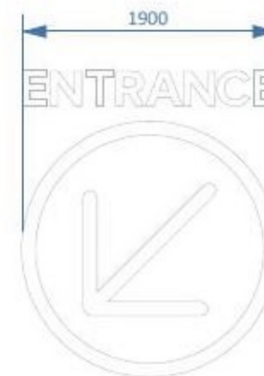
Sign: 02 - Scale 1:50 1-off Ø1,900 Entrance Arrow: Flat 3mm Aluminium Finished White Ral 9003