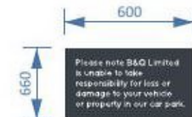
Sign 05: - Scale 1:25 2-off Folded Aluminium Panels Finished Grey Ral 7021 c/w vinyl Graphics to Face