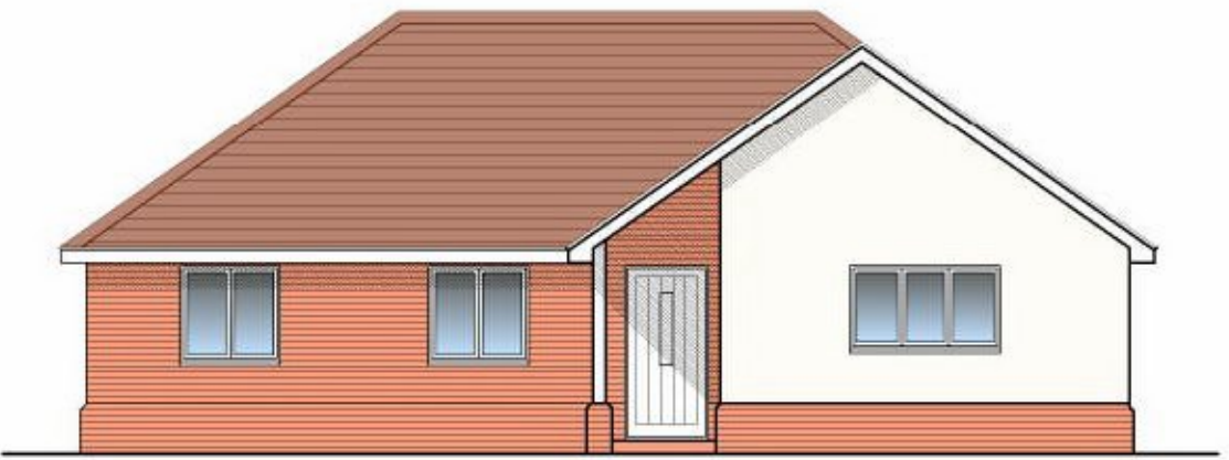
FRONT ELEVATION (1:100)