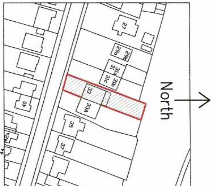
1:1250 SITE LOCATION PLAN