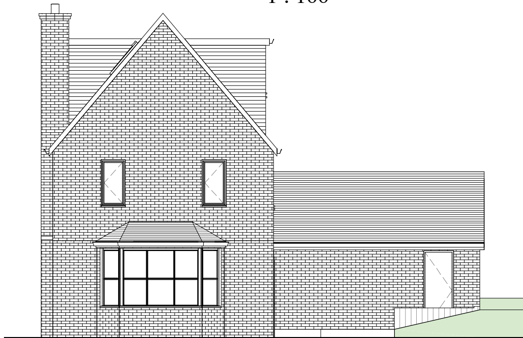
Existing West Elevation 1 : 100