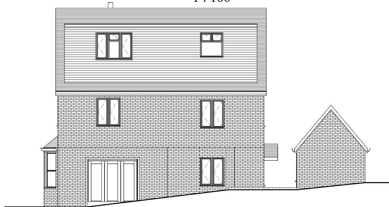
Existing North Elevation II 1 : 100