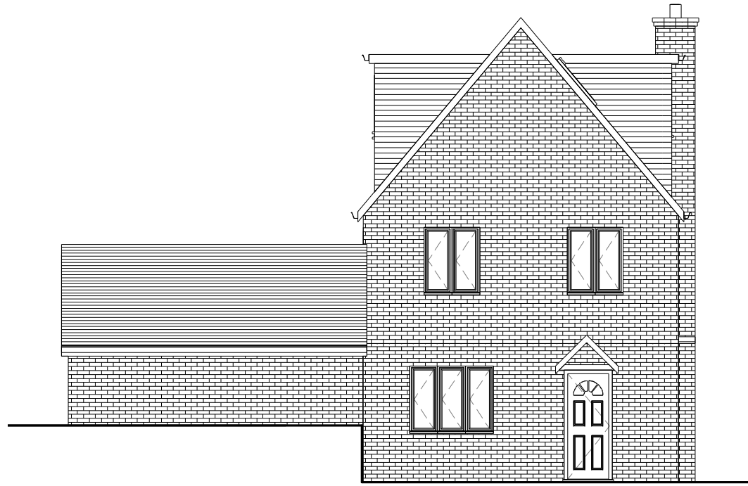
Existing East Elevation 1 : 100