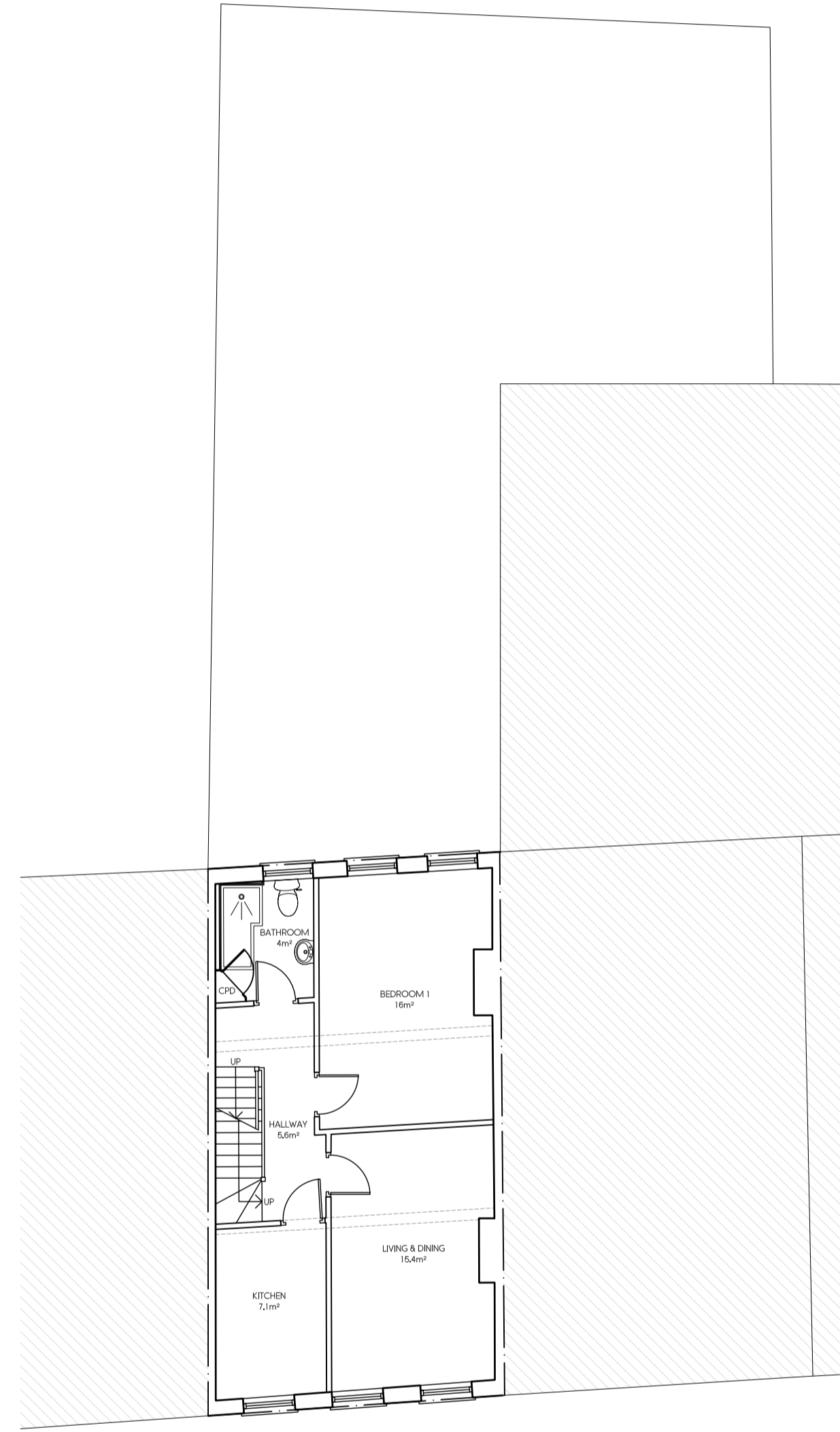
EXISTING FIRST FLOOR PLAN GIA: 54 m 2