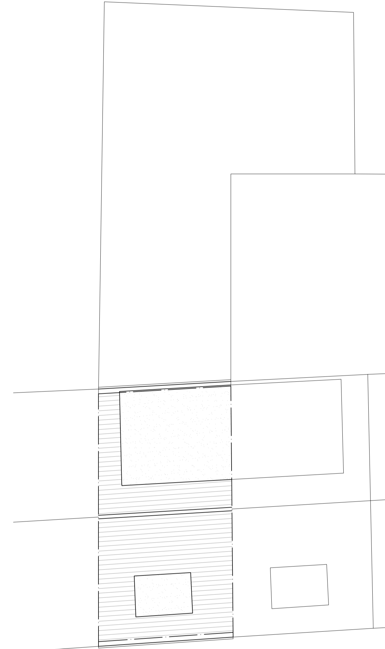
EXISTING ROOF PLAN