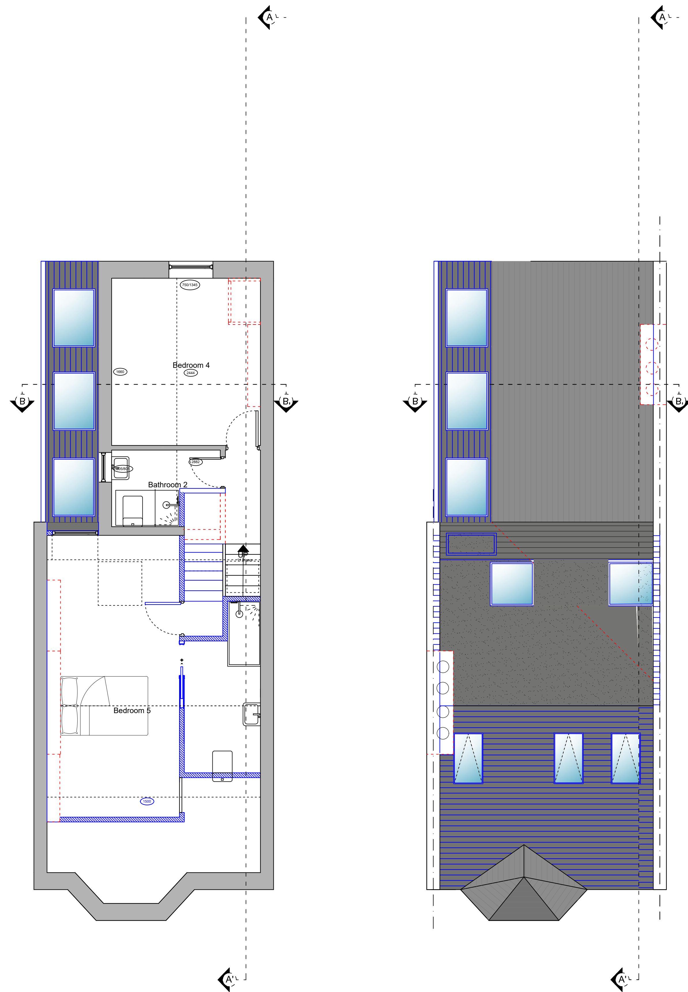
○ Second Third Floor Plan 1:50