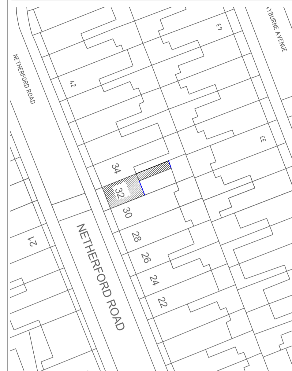
Block Plan 1: 5 0 0