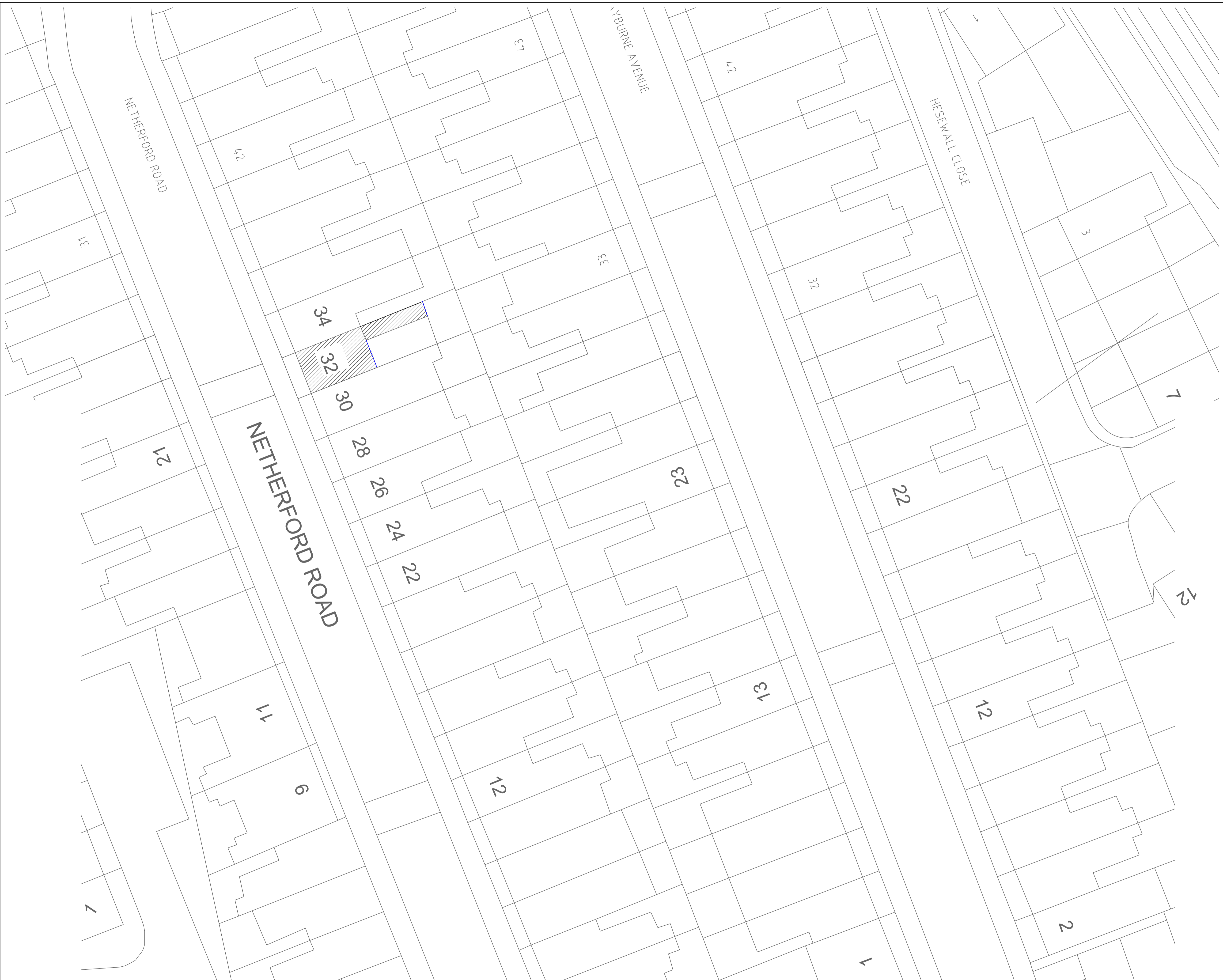
Site Plan 1: 2 0 0