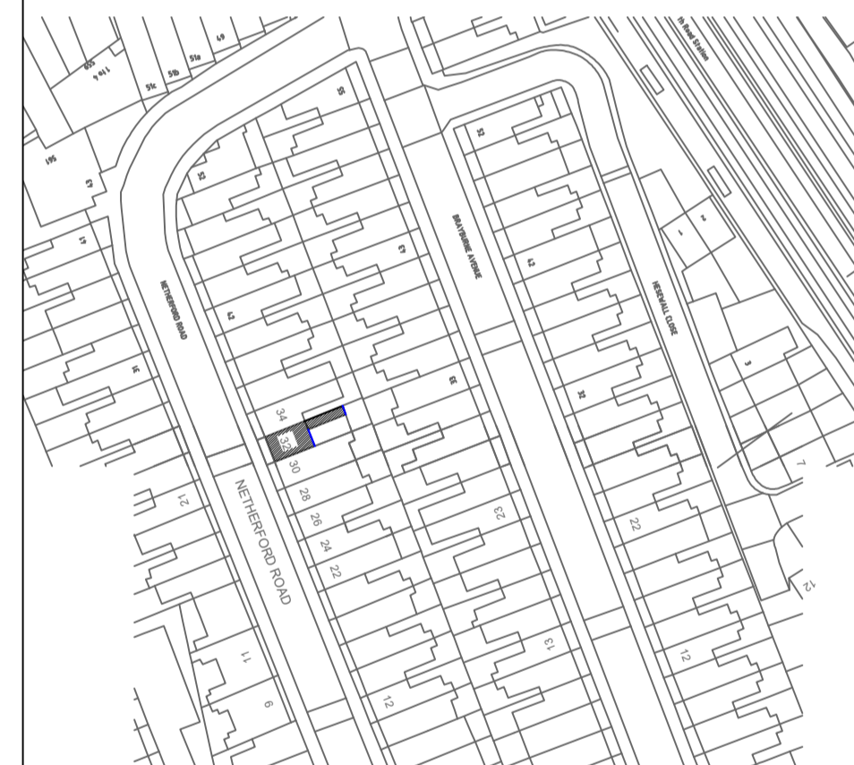
Location Plan 1: 1 2 5 0