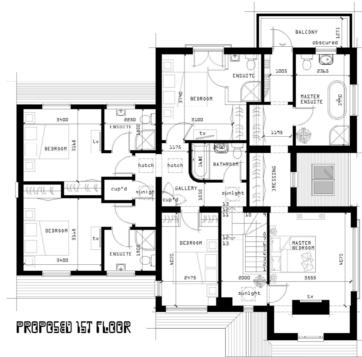
PROPOSED 1ST FLOOR