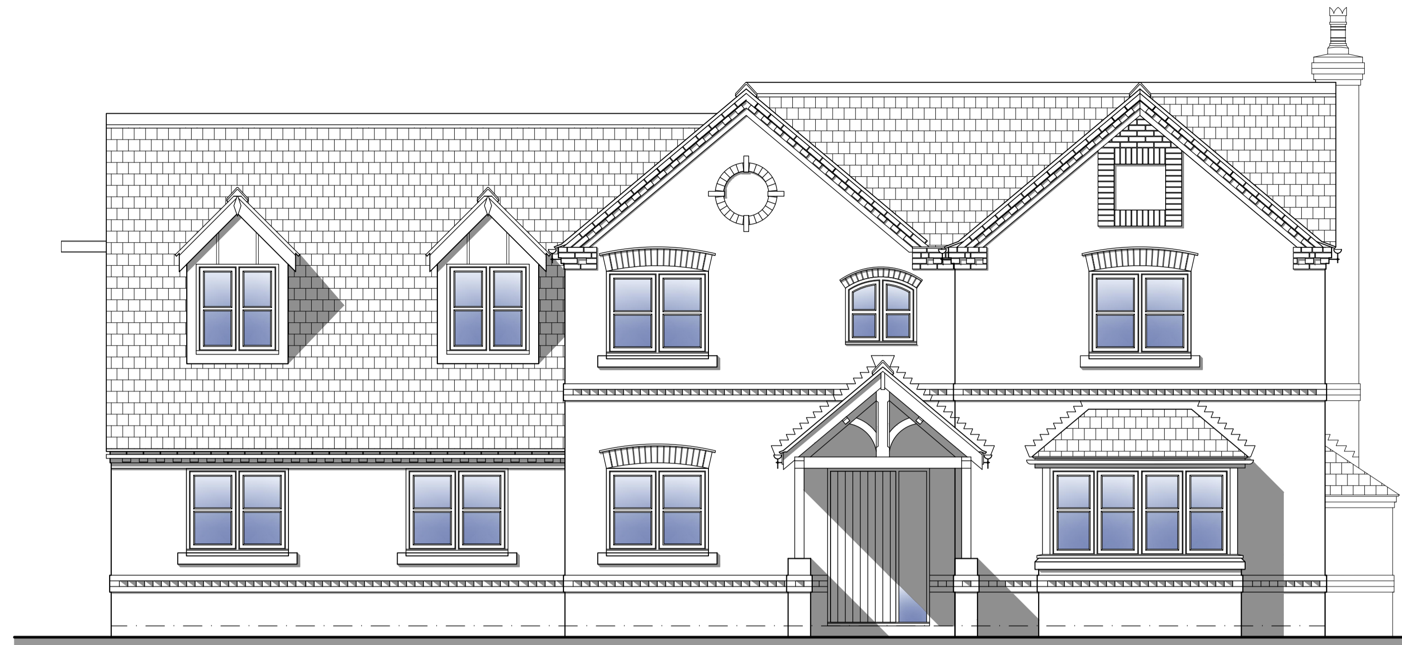
PROPOSED EAST ELEVATION (SCALE 1:50)