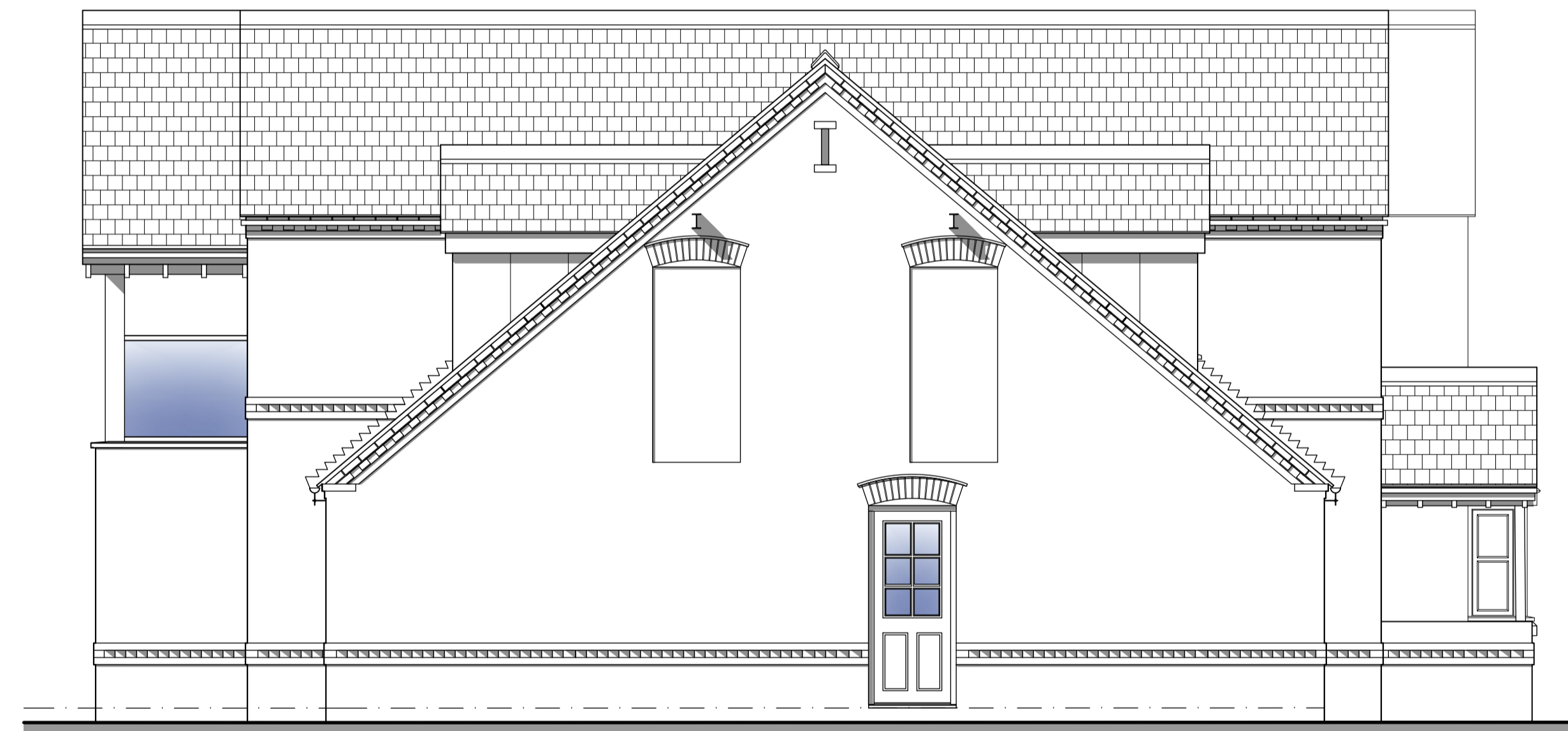
NORTH ELEVATION (SCALE 1:50)

A 08/06/21 ELEVATIONS RE-LABELLED AS REQUESTED BY LA