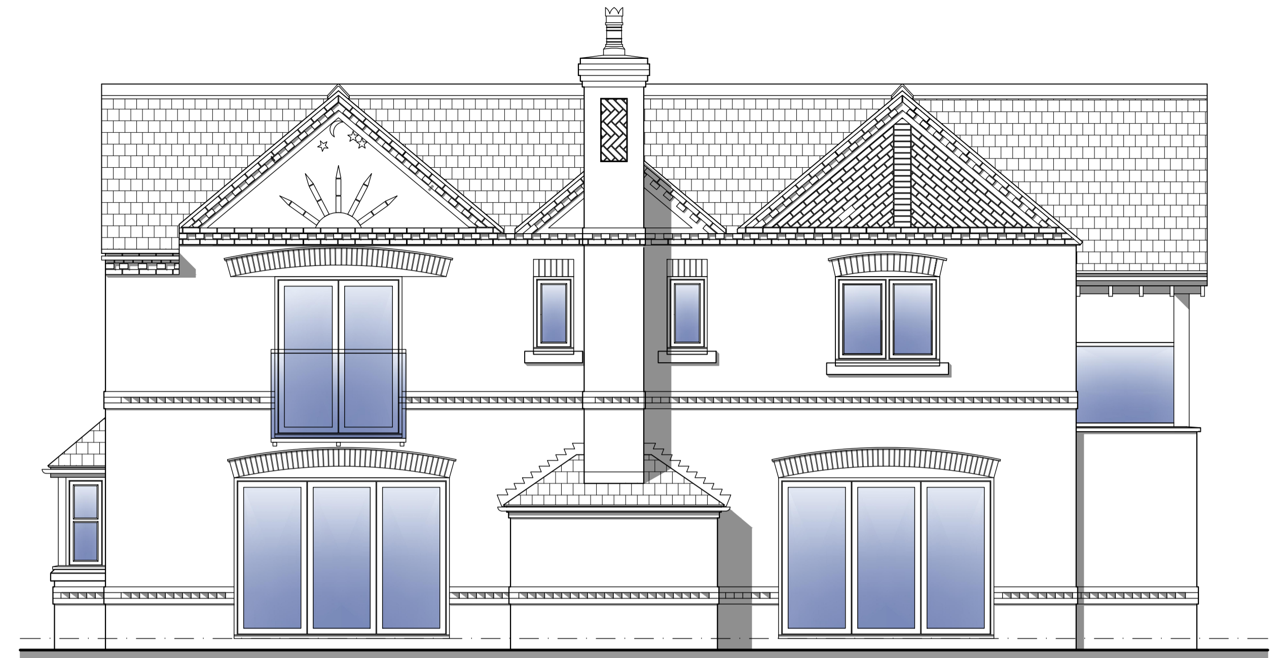
SOUTH ELEVATION (SCALE 1:50)