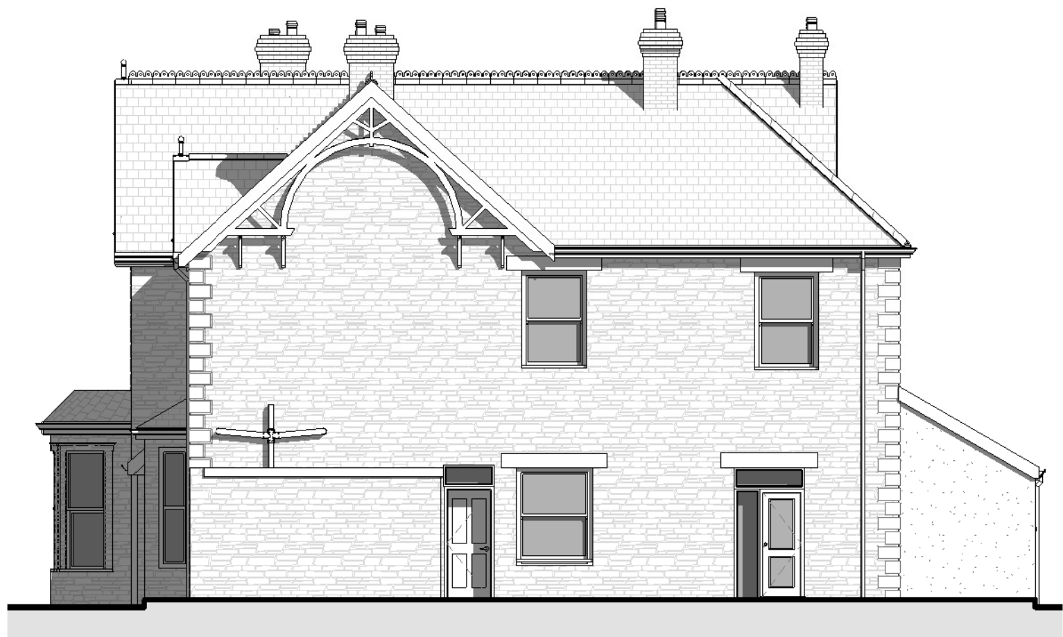
3 South Elevation 1 : 100