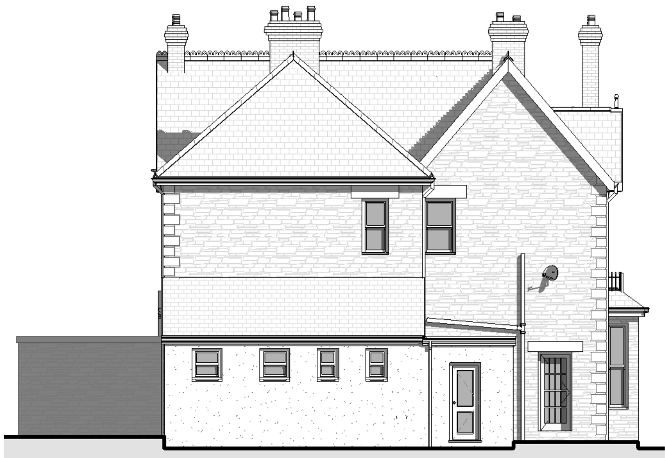
4 East Elevation 1 : 100

All dimensions to be checked on site. Whilst every effort has been made to ensure accuracy; there may vary due to the size and age of the building.