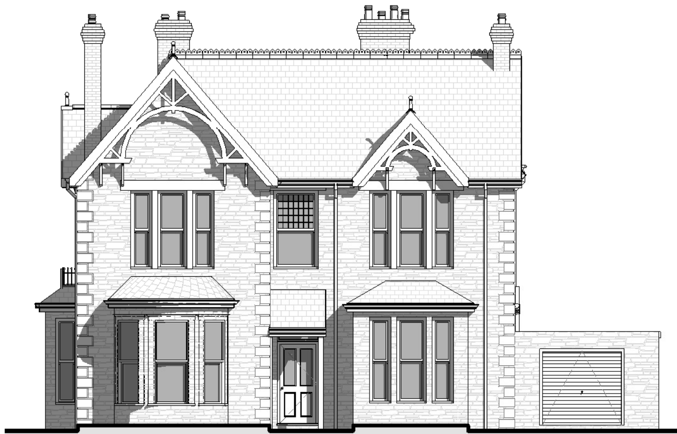
1 West Elevation 1 : 100

THIS DRAWING IS COPYRIGHT © ALL RIGHTS RESERVED. NO PART OF THIS DRAWING IS TO BE REPRODUCED OR TRANSMITTED IN ANY FORM OR BY ANY MEANS ELECTRONIC OR MECHANICAL, INCLUDING PHOTOCOPYING, RECORDING, OR BY ANY INFORMATION STORAGE AND RETRIEVAL SYSTEM, WITHOUT PERMISSION IN WRITING FROM THE ARCHITECT.