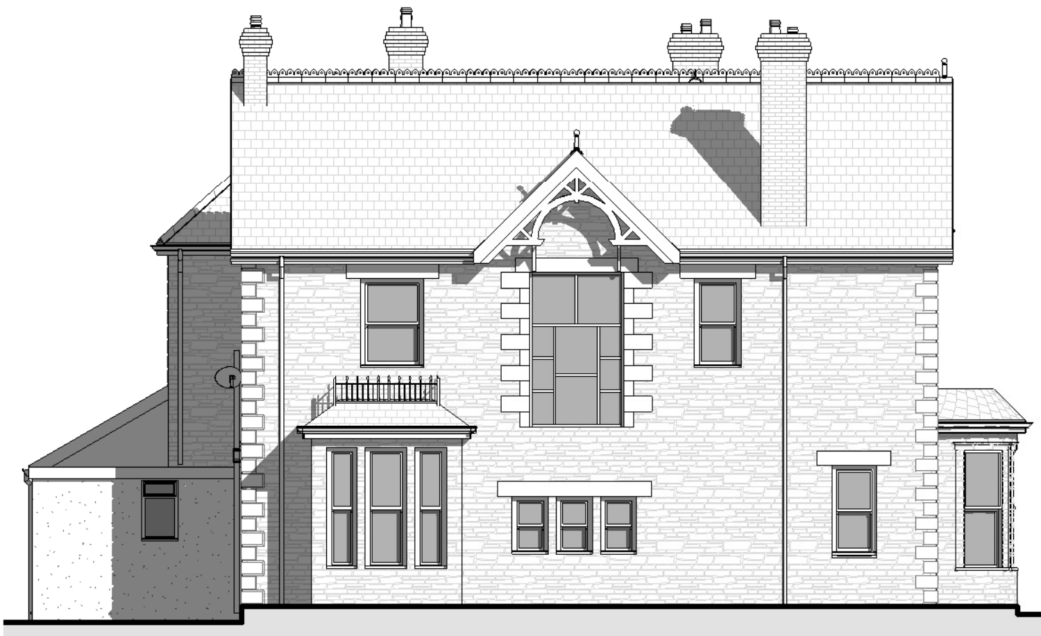
2 North Elevation 1 : 100