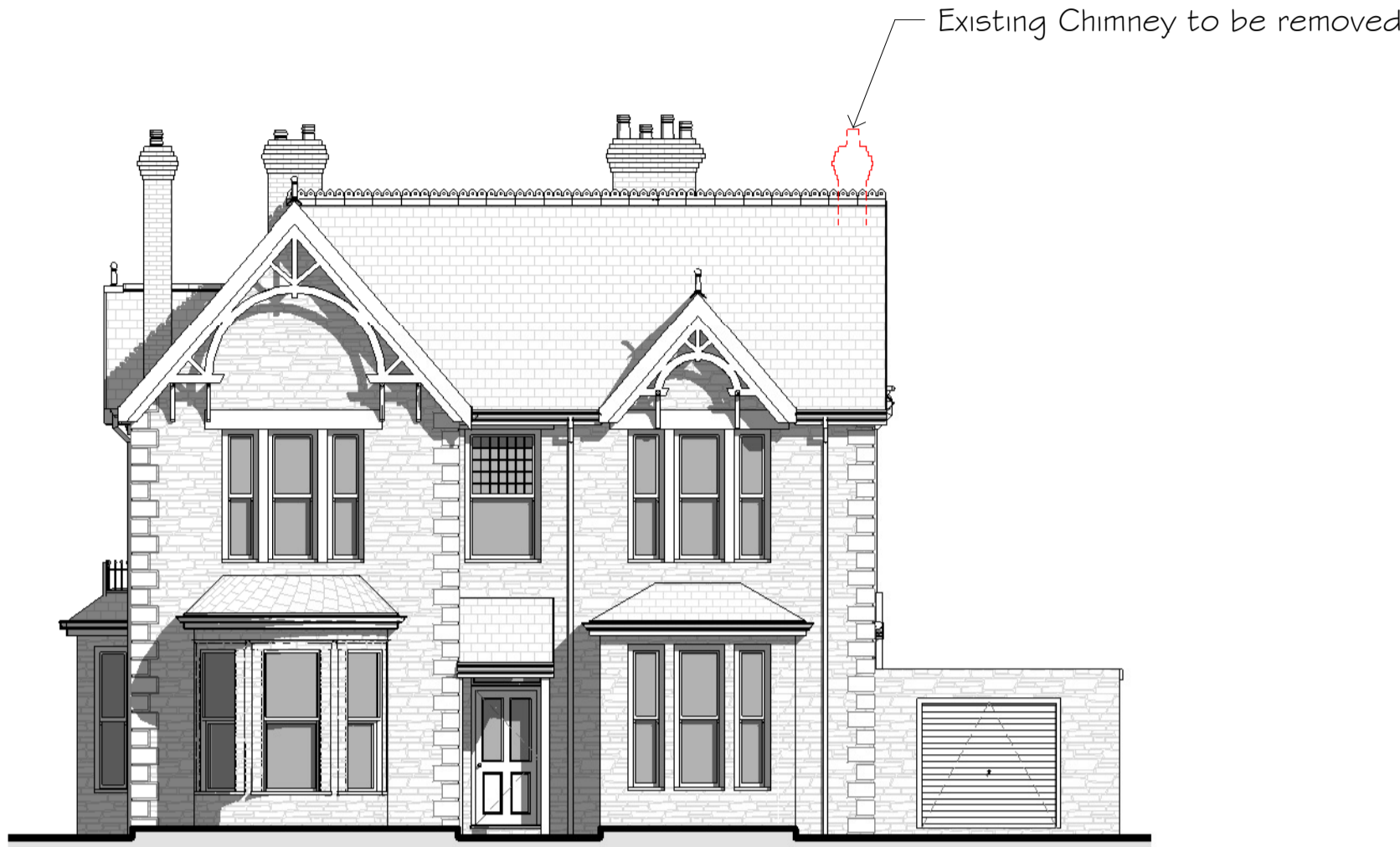
1 West Elevation 1 : 100

THIS DRAWING IS COPYRIGHT © ALL DIMENSIONS GIVEN ARE TO BE TAKEN IN PREFERENCE TO SUB-CONTRACTORS AND SUPPLIERS MUST VERIFY ALL DIMENSIONS ON SITE BEFORE PROCEEDING. ANY DISCREPANCIES ARE TO BE REPORTED IMMEDIATELY BEFORE PROCEEDING.