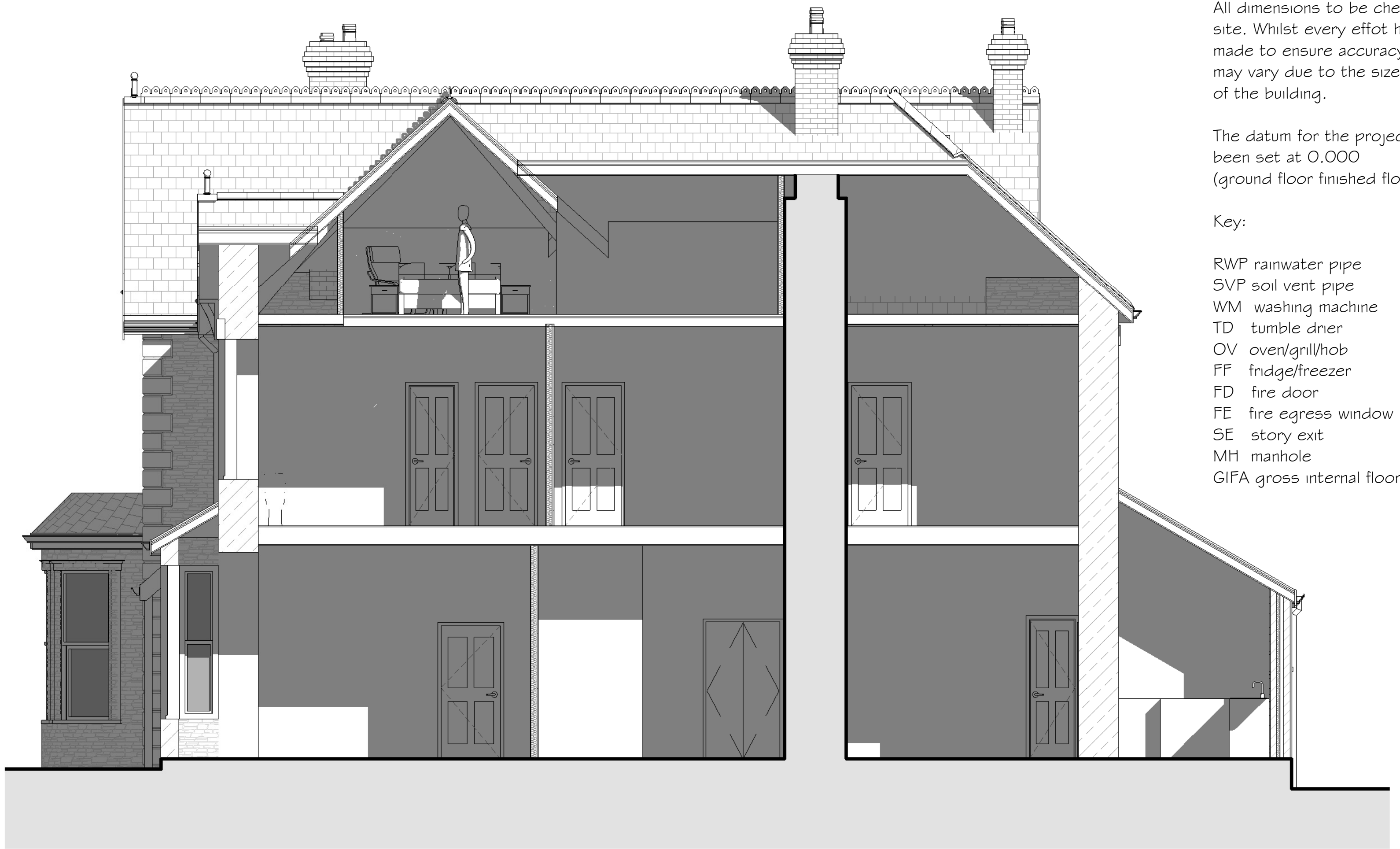
1 Section A-A 1 : 50