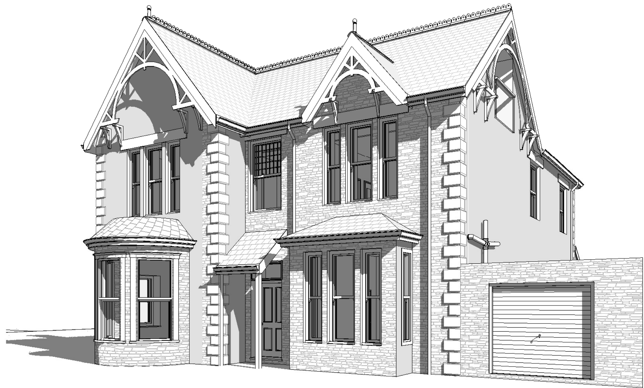
3 3D View Front

All dimensions to be checked on site. Whilst every effort has been made to ensure accuracy; there may vary due to the size and age of the building.