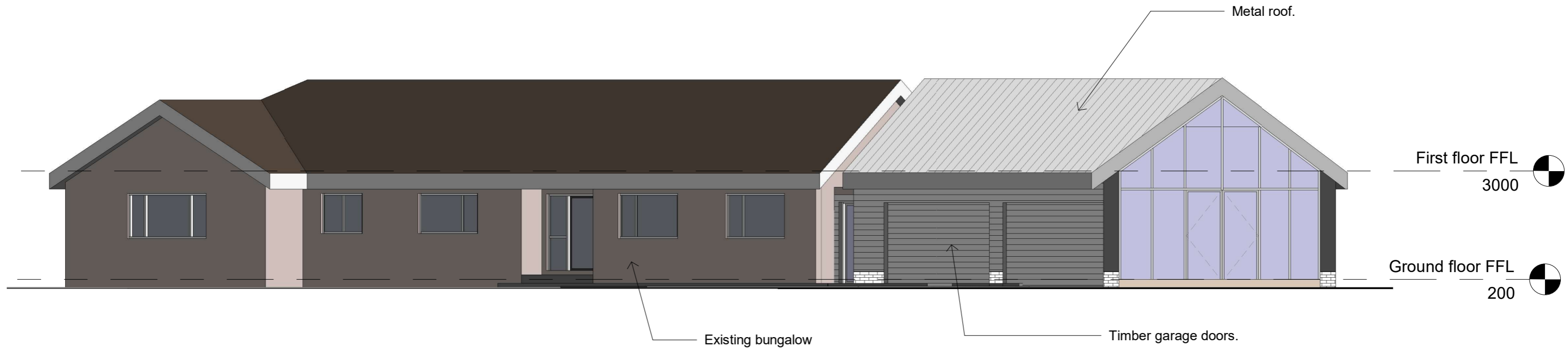
3 End Elevation 1 : 100