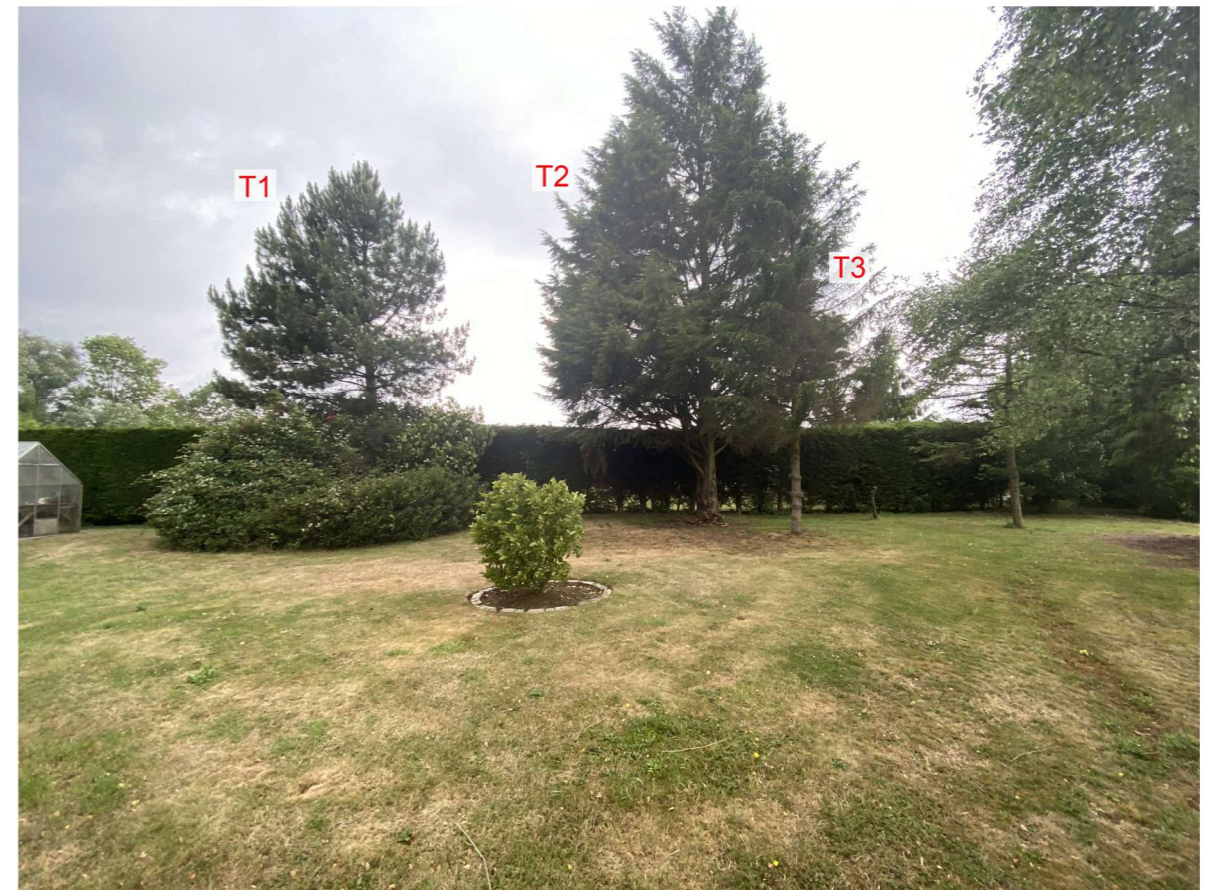
Existing photograph identifying trees to be removed