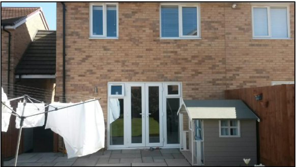
Existing rear view