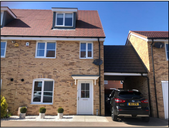
Existing front view