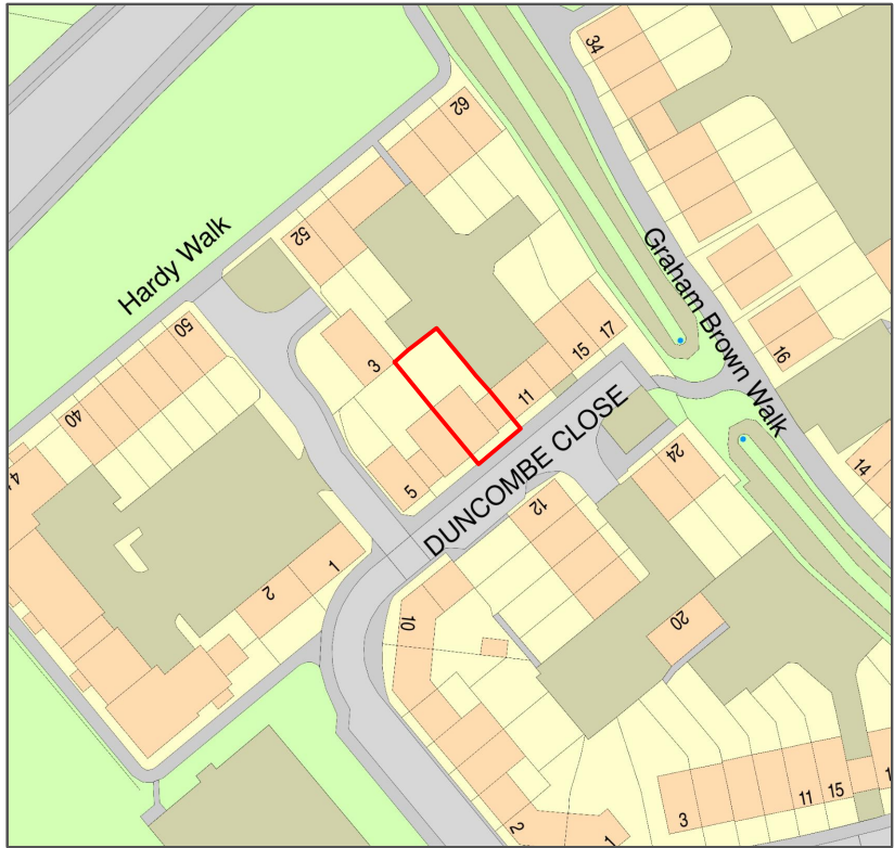
Existing Location Plan 1:1250 @ A3