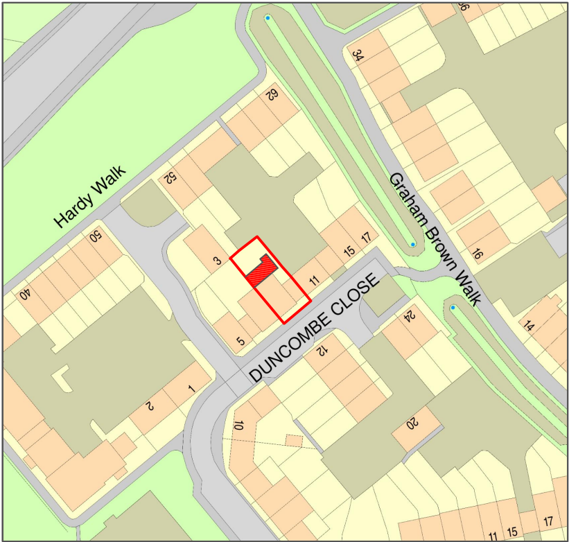
Proposed Location Plan 1:1250 @ A3