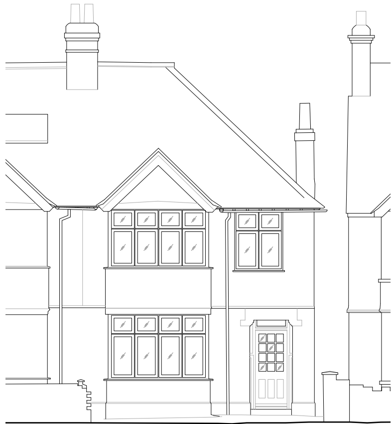
1 Front Elevation Scale: 1:100