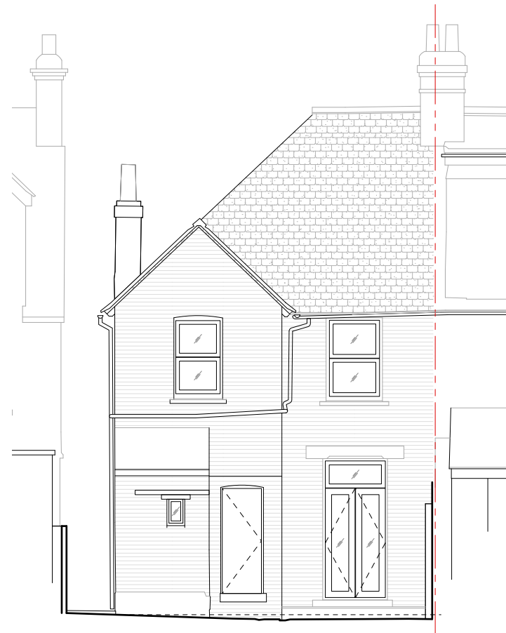
3 Rear Elevation Scale: 1:100