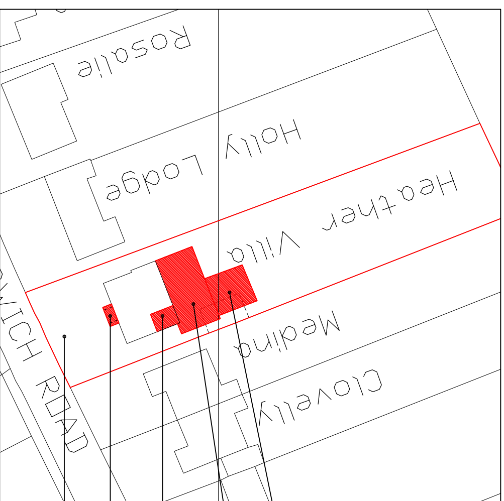
Block Plan as proposed Scale 1:500