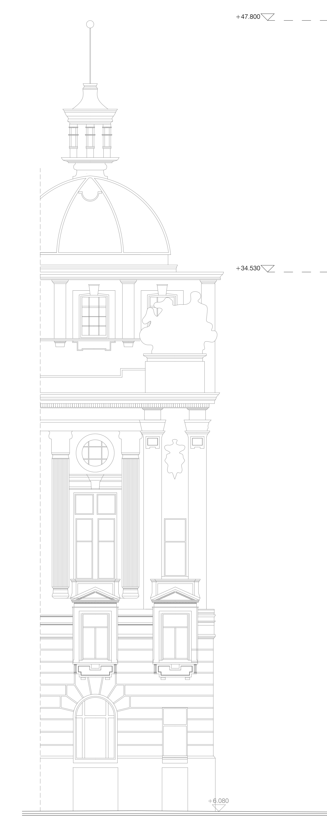
SOUTH (BROOMIELAW) ELEVATION 1:100