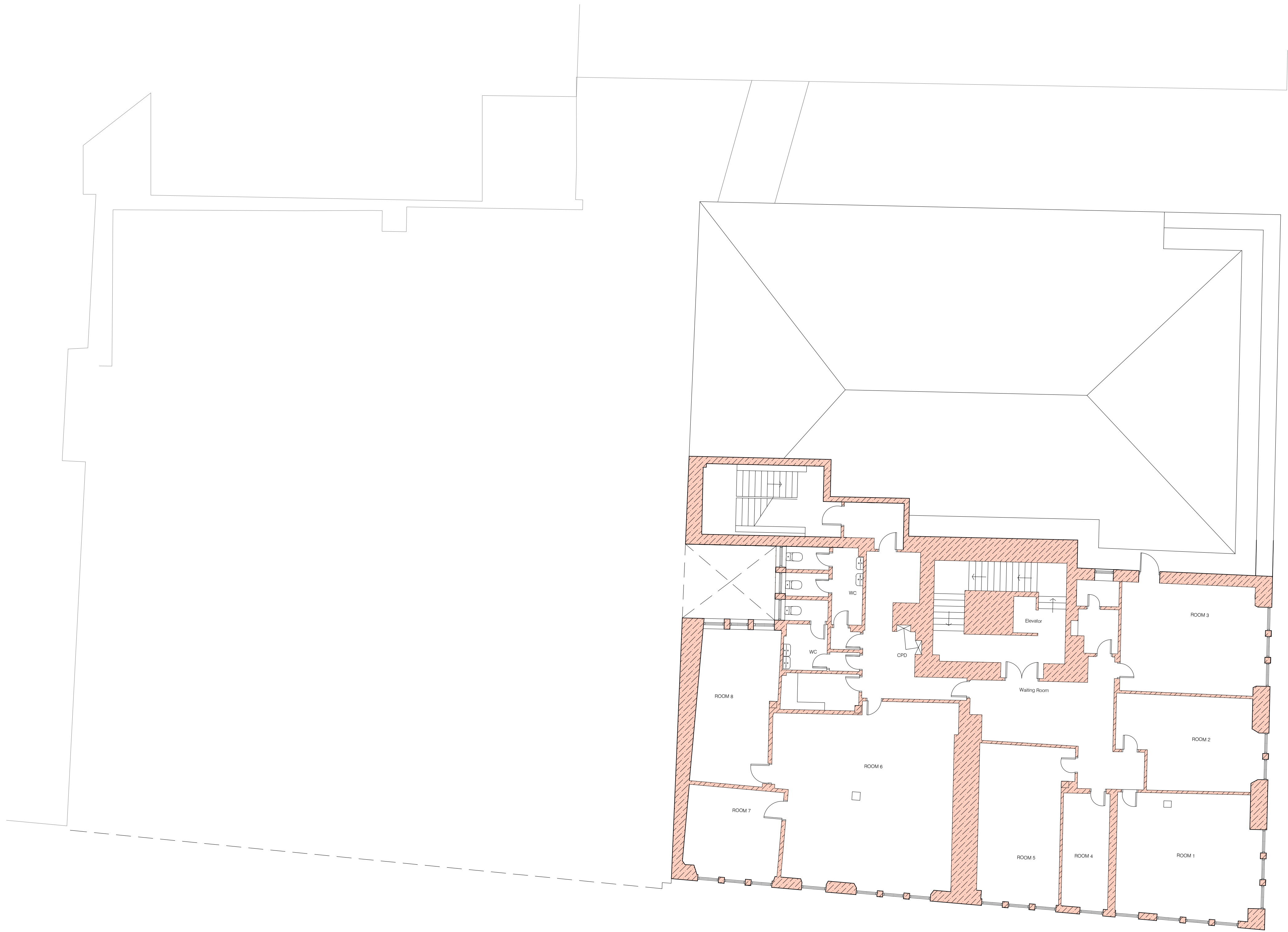
THIRD FLOOR PLAN - AS EXISTING 1:100